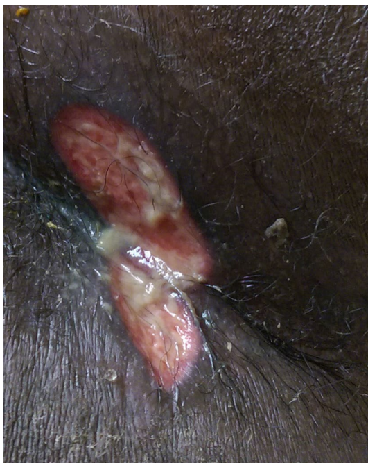
FIGURE 1 Shallow ulcer with purulent exudate and raised margins in the perianal region

Two days after discharge, he presented to our hospital with worsening rectal pain, fevers, and chills. He was restarted on acyclovir intravenously, and dermatology was consulted. A 4-cm shallow ulcer on the perianal buttock with fibrinous yellow exudate and raised margins was noted (Figure 1) and biopsied. Histopathology revealed interface dermatitis with basal vacuolization as well as spongiosis and scattered dyskeratotic cells (Figure 2). Periodic acid-Schiff, cytomegalovirus (CMV), Grocott's methenamine silver, and Treponema pallidum infectious stains were negative. Laboratory assessment