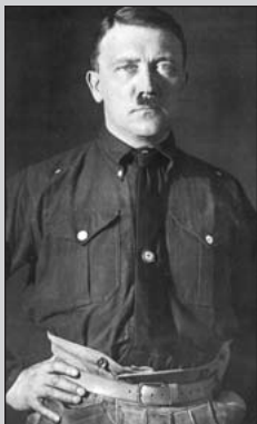
Adolf Hitler, Deceased Despot

"The yankees call it slavery; we call it tradition."