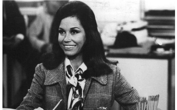
Scene from The Mary Tyler Moore Show of Mary Richards (1977)

may be absent from her usual role. 6 Rob is not the only one uncomfortable with Laura working; when Laura is offered a permanent position dancing on the television show, she turns the offer down, telling Rob, just as she did when he proposed to her, "I don't want to be a dancer. I want to be your wife." 7 Rob is portrayed as being entirely in the right throughout the episode, and Laura as the person in the wrong. The message communicated is clear: a woman's priorities should be her husband and her family, not a career. In today's terms, such an attitude would be considered sexist. However, during The Dick Van Dyke Show's run, such a family dynamic was normal.