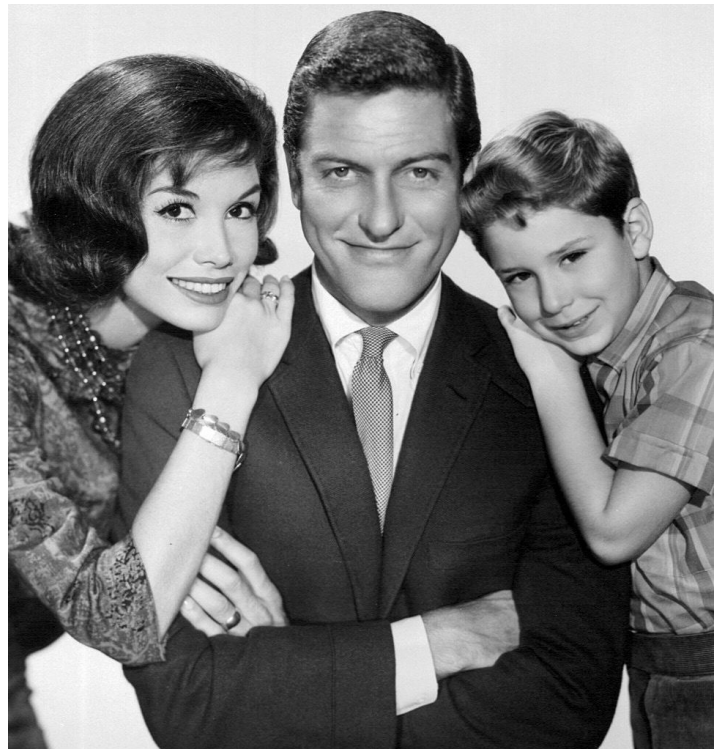
The Petrie family from The Dick Van Dyke Show (Fall 1963)

traditional family and gender values, and that this moderate approach undermined Mary Richards’s feminism. 19 However, the moderate, subtle nature of The Mary Tyler Moore Show had exactly the opposite effect on the feminist cause. Before The Mary Tyler Moore Show , independent women were condemned as overdramatic, feminist “bra-burners.” Second Wave Feminism was a radical movement and was met with contempt by a great deal of society. Mary Richards, however, showed the relatable side of feminism. She was an incredibly endearing character, both to her fellow characters and to her viewers, as can be seen from the immense and lasting popularity of the show. Mary struck the balance between traditional femininity and modern feminism.