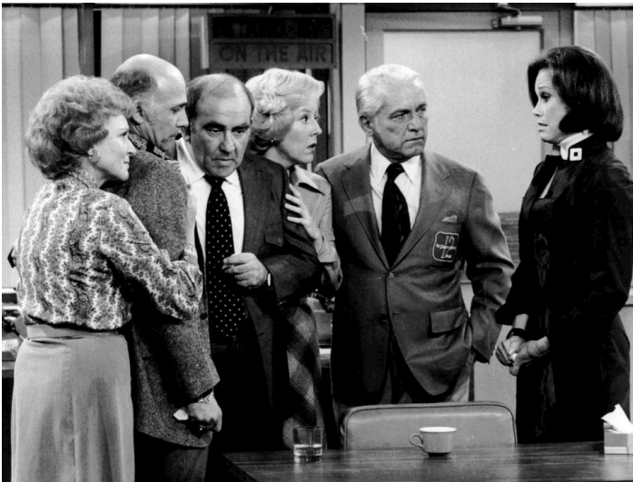
Scene from The Mary Tyler Moore Show (1977)