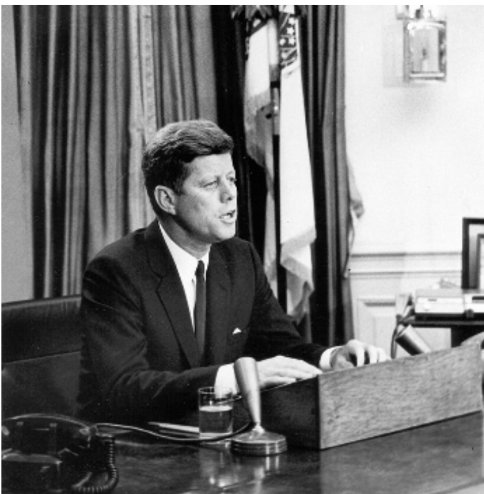
President Kennedy addresses the nation on Civil Rights (1963)