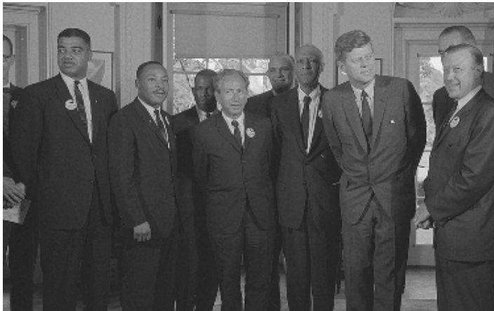
Civil rights leaders, including Martin Luther King, Jr., and President John F. Kennedy in the Oval Office (1963)

The Kennedy brothers both targeted the bad press that the civil rights crisis was giving America on the world stage as one of the largest concerns regarding civil rights. Also, in the same month, Johnson delivered a speech at Gettysburg calling for new civil rights action, and Kennedy denounced him privately for “trying so hard to be a liberal.” 45 Johnson would “accomplish nothing.” 46 Before the March on Washington in August, the President expressed concern that it would turn into a riot and destroy the American image altogether. Kennedy saw the march as a “pistol pointed directly at the collected head” of the country. 47 But his mentality really may have been shifting.