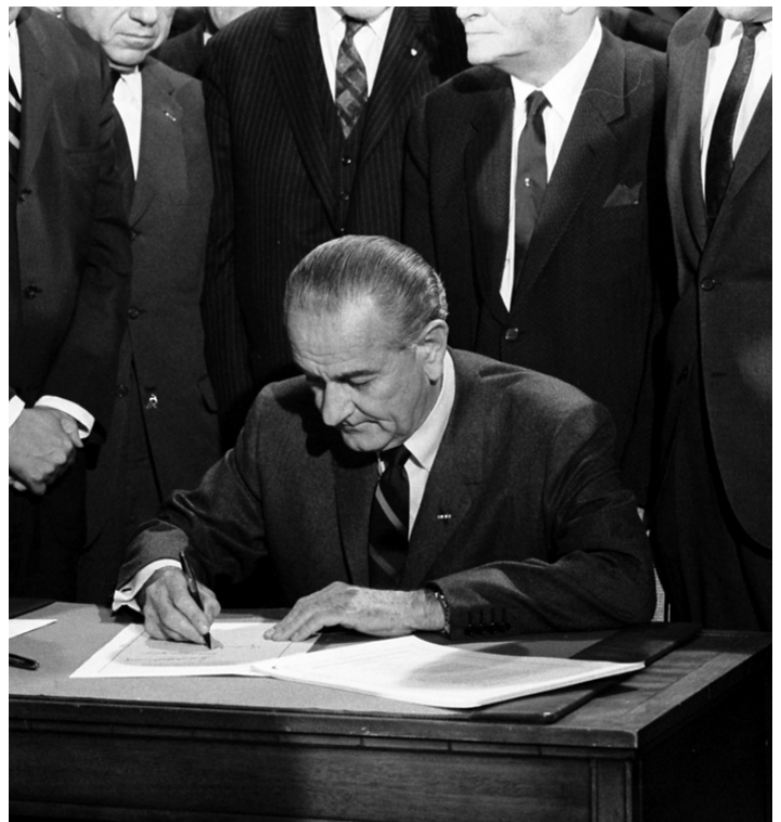
President Lyndon B. Johnson signing the Civil Rights Act of 1968

mixed-race guests and met with activist leaders to discuss what needed to be done. 13 At the July 1960 Democratic National Convention in Los Angeles, Kennedy spoke as though civil rights issues would be one of the central planks of his platform. 14 Then in August at a special Senate session, he condemned the previous policy of the Republican Party regarding civil rights issues, proudly declaring that he could desegregate housing “with the stroke of a pen,” meaning with an executive order. 15 The New York Times front page read “Kennedy Pledges Civil Rights Fight.” 16