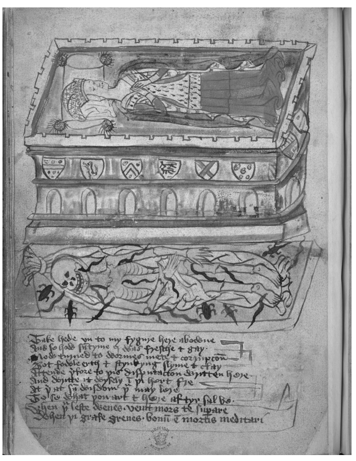
Drawing of a grave from a Carthusian miscellany of poems, chronicles and treatises (c. 15th century)

discussed. Rather than attempting to induce repentance, as the medium most frequently intends to do elsewhere, "A Disputacione" guides its reader to accept the real experience of the body upon dying. This associates it with poetry concerned with contemptus mundi as much as the Christian doctrine of redemption. This is in keeping with the images that accompany the poem in its manuscript. For example, although an image of Christ on the Crucifix with a living man praying at his feet illustrates the poem on the folium at which the dream vision begins, this image is replaced thereafter on each leaf with the structurally equivalent repeated image of the corpse being eaten from below by the worms. At least for the illustrator, the soul's redemption by Christ was not the central concern of the poem. Rather, the poem's focus is on the human experience of death until their moment of redemption and attributes the bodily suffering at this stage to human sinfulness.