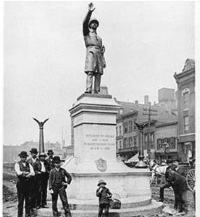
Haymarket Riot Monument, by John Gelert (1889)

The government struggled to keep the Commune out of public memory as the exiled Communards returned to the city, threatening to renew interest in the Commune and France's revolutionary past. 33 The early 1880s witnessed a growing consciousness of the Commune's memory through the evocation of the infamous wall in the Père-Lachaise cemetery as a memorial site in poems and songs, which was soon followed by drawings, prints, and paintings. 34 In the most comprehensive early history of the Mur des Fédérés (Communards' Wall), Madeleine Rebérioux argues that the evocation