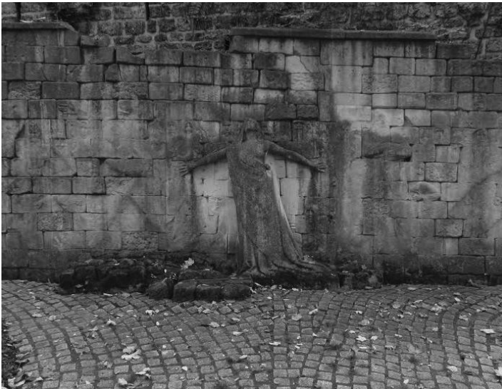
Monument aux victimes des révolutions in Paris (2015)

On the evening of 4 May 1886, a group of Chicago police officers arrived to supervise a peaceful anarchist rally in support of an eight-hour work day. As they approached and ordered the rally to disperse, an unknown individual threw a homemade bomb at the group of officers. 4 During the ensuing violence in the aftermath of the bomb's explosion, seven policemen and an unknown number of civilians were killed. 5 Chicago's anarchists, of whom a large number were German immigrants, were immediately blamed for the incident: nine were indicted, seven stood trial, eight were found guilty, and four were executed. 6 There was minimal evidence against the defendants, save for their radical anarchist rhetoric printed in newspapers like The Alarm and the Arbeiter-Zeitung . The bomber's identity was never conclusively determined—the eight anarchists were convicted primarily on the basis of their writings. 7