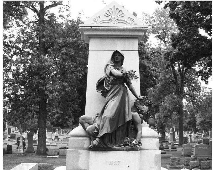
Haymarket Martyr’s Memorial in Chicago, IL (2009)

tion as the center of activism for the anarchist and socialist movements. With the city’s crackdown on the radicalism associated with Haymarket, the monument turned Waldheim Cemetery into a safe haven for the anarchist movement and other radical groups. The cemetery remained a sacred space of remembrance and mourning, but also became a place of action and aspiration. 22 The significance of The Haymarket Martyrs’ Monument transcended its local context, transforming Waldheim Cemetery into “a revolutionary shrine, a place of pilgrimage for anarchists and socialists from all over the world,” establishing the Haymarket martyrs’ place in the mythology of the radical left. 23