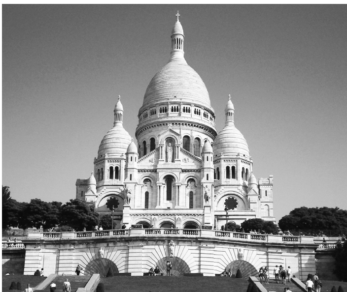
Basilique du Sacré-Cœur de Montmartre in Paris (2011)

In contrast, Paris was much slower to memorialize the Commune, even though the city’s municipal council was full of republicans and radicals who had supported the Commune, or