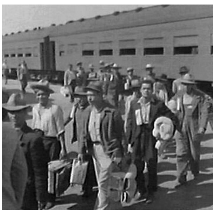
The first Braceros arriving in Los Angeles by train (1942)

Another manner of weakening the bargaining power of the braceros was their lack of reinforcement from or alliance with domestic agricultural labors. This division was caused by the braceros' role in depressing wages, which prevented their alliance with domestic farmworkers in the United States.83 In fact, domestic worker strikes, on the whole, were directly responsible for the removal of bracero workers instead of engaging in a collaborative unionization effort across all sectors of agricultural labor, most evidenced in the instances of the 1947 DiGiorgio Fruit Corporation strike and the 1961 lettuce worker strike.84 A popular strike song composed in 1952 even warned against "taking the striker from the rival of the contracted bracero."85 Rather than perceiving the braceros as allies in the struggle for the improvement of agricultural labor demands, domestic agricultural workers perceived the braceros as their reason for striking.