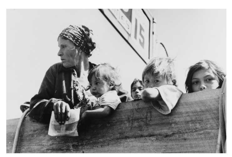
Mexican woman and children at a station in Neches, TX (1939)

By Leigh Avera '16 Vanderbilt University