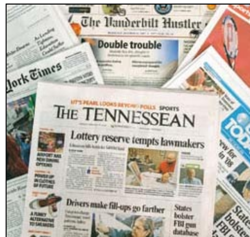
The Gannett Readership Program started bringing commercial newspapers to campus in January as part of a pilot program.