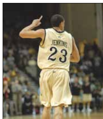
BECK FRIEDMAN / THE VANDERBILT HUSTLER