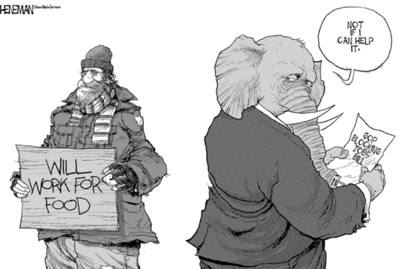
DREW SHENEMAN/MCT CAMPUS