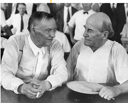
Attorneys Clarence Darrow (left) and William Jennings Bryan (right) during the Scopes “Monkey” Trial

Most scholars give up on Fundamentalists after they encounter Bryan’s rather embarrassing performance at the Scopes Trial. At the time, however, many people actually thought Bryan had bested Darrow. In fact, when he died (only a few days after the trial ended) Bryan was engaged in what amounted to a high-spirited, public continuation of his testimony, often to considerable crowds. My project picks up here, precisely where most investigations leave off. I also take a much broader view of political involvement than previous studies of Fundamentalists have allowed for. Political theorists—from Plato to John Rawls—have long understood that there is much more to “politics” than just the day-to-day workings of a society’s political processes (however simple or complex they may be). Political history is, on the one hand, the chronicling of “who gets what, when, and how” as Harold Laswell’s famous definition would have it, but it’s also the story of how competing ideals vie for influence, of people’s public and often very sincere striving to create a virtuous social order. In short: it’s the story of the push and pull of one group of citizens’ wishes against another’s. Instead of taking the standard approach and discussing Fundamentalists in isolation from the socio-political culture surrounding them, my project examines their place within mid-twentieth-century American society, paying special attention to the ways in which they dialogued with and even engaged the culture-at-large.