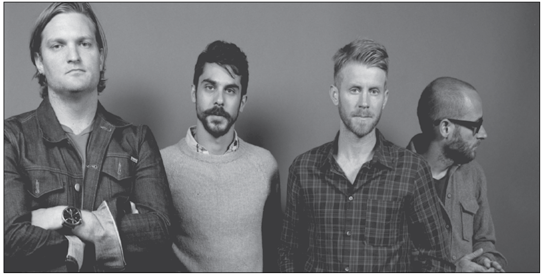
LUCY HAMBLIN/Photo Provided