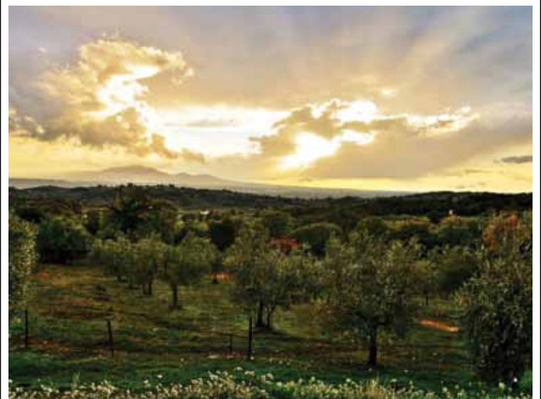
Umbria, Italy Study Abroad: Vienna, Austria