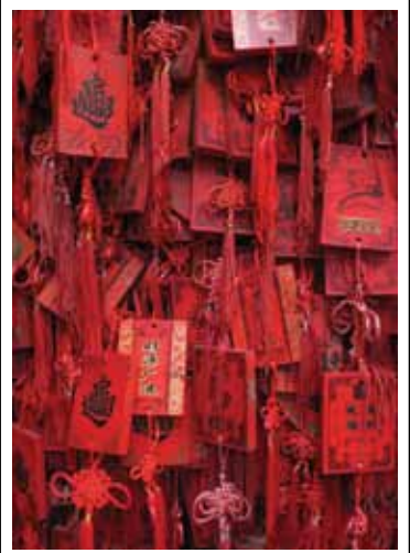
Beijing, China as seen by Amanda Heinbockel Study Abroad: Beijing, China

To learn more about study abroad, visit the Global Education Office at www.vanderbilt.edu/geo .