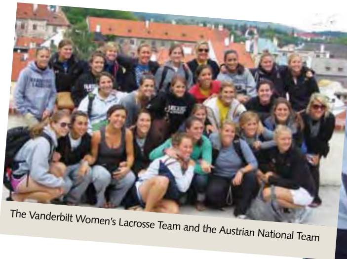
The Vanderbilt Women's Lacrosse Team and the Austrian National Team