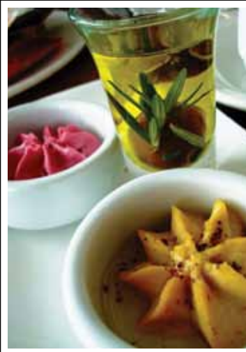
Auckland, New Zealand as seen by Vanessa Yu Study Abroad: Auckland, New Zealand