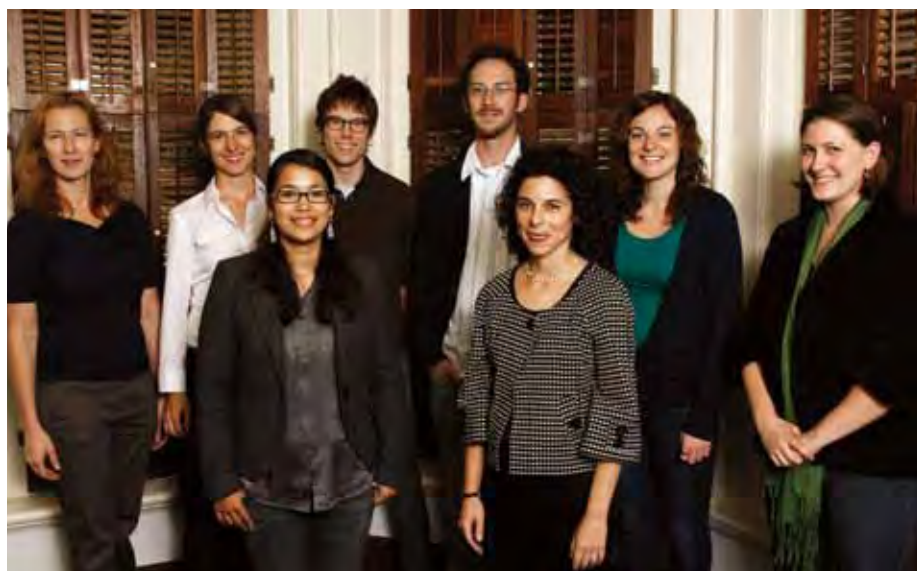
2009-2010 Robert Penn Warren Graduate Fellows.

"We are currently exploring several options for sending Vanderbilt graduate students to Queen's in order to further develop the international ties that we are forging with the Queen's and Belfast communities."