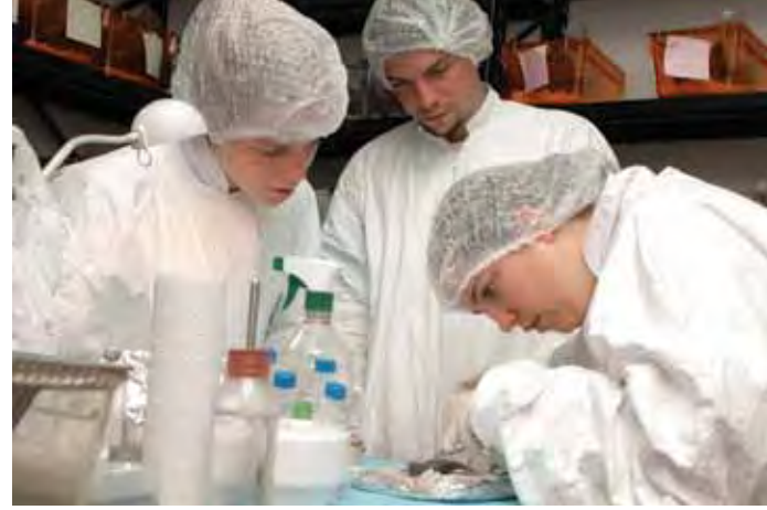
Researchers with the INFANT foundation.

The article presents evidence which clarifies a number of the characteristics of the impact of the H1N1 virus on children. Co-infection with other organisms, such as Respiratory Syncytial Virus (RSV), or bacterial pneumonia, was uncommon. The H1N1 virus alone was responsible for severe illness, not a secondary, or concomitant infection.