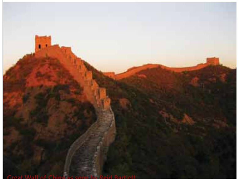
Great Wall of China as seen by Reid Bartlett Study Abroad: Beijing, China