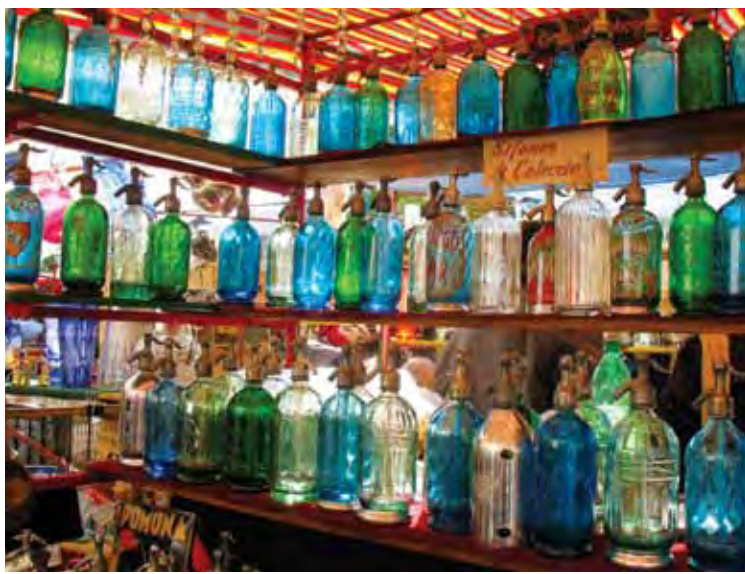
Buenos Aires, Argentina Study Abroad: Buenos Aires, Argentina

To learn more about study abroad, visit the Global Education Office at www.vanderbilt.edu/geo .