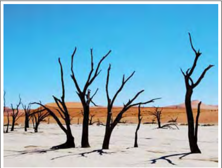
Deadvlei, Namibia Study Abroad: Capetown, South Africa