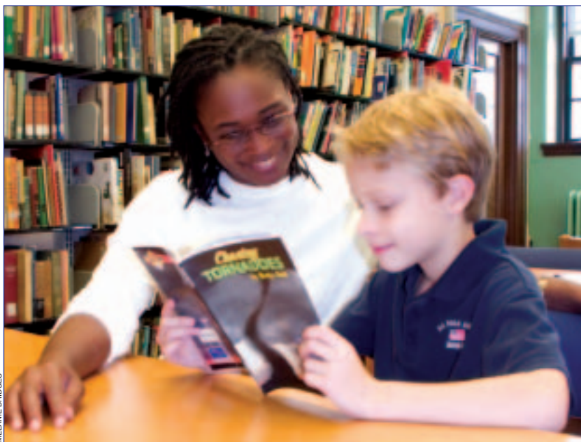
The effectiveness of a multicomponent reading comprehension program for addressing the diverse needs of struggling readers is being evaluated.

N ew knowledge needed to improve the lives of individuals with developmental disabilities and their families comes through research. Conducting state-of-the-art research requires substantial funding.