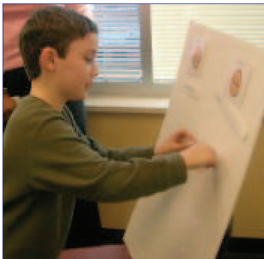
A student in a TRIAD social skills group sorts pictures as a way of learning to distinguish between appropriate and inappropriate social behaviors.

S ocial responses in young children are often taken for granted—a wave good-bye, a happy response to an unexpected toy, or a finger pointed to a familiar friend. But these common childhood responses are not taken for granted by parents of a child with autism. The absence of these types of social responses is common among young children with autism. Their importance as early markers is increasingly being recognized.