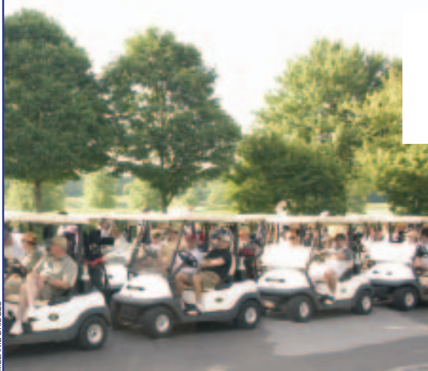
Get ready for June 16 Waddell & Reed Financial Services Charity Golf Tournament.