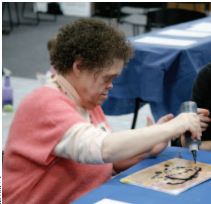
Artists of Full Circle Art and community artists worked with youth and young adults with disabilities to create art in a variety of mediums during workshops.