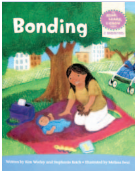
A Discovery Grant was instrumental in launching research on a developmental series of books for mothers to read to their young children to promote maternal and child health.

McDonald’s lab also is using their mouse model to investigate gender difference in gene expression that may play a role in ADHD, since its incidence is higher in males than females.