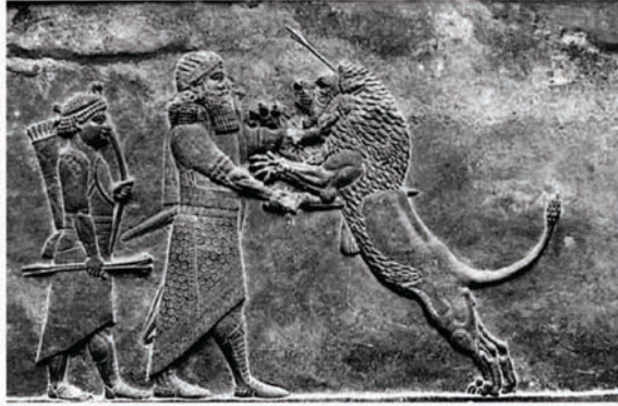
Figure 1: Assurbanipal, king of Assyria, thrusting a dagger into a lion's belly.

the abdomen (חֲמֵשׁ), spilling his guts to the ground and leaving him hemorrhaging to death. 27