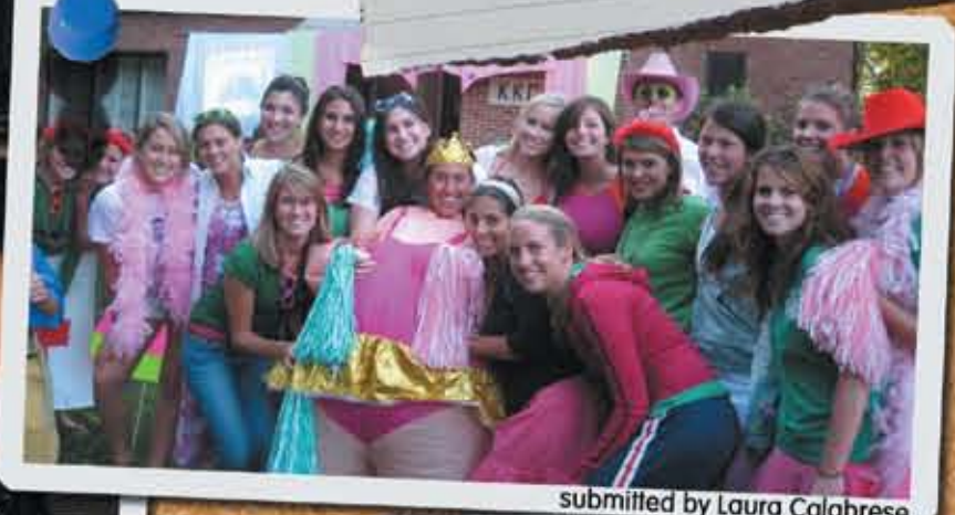
submitted by Laura Calabrese