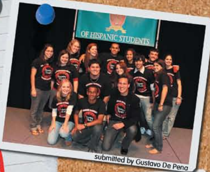
submitted by Gustavo De Pena