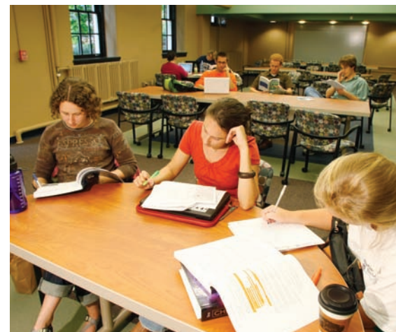
Students study in the spacious Ground Floor Project Room of the Peabody Library. The area was renovated last summer to make room for a research consultation room, a conference room, the project room, and staff offices.

The ground floor of the Peabody Library was renovated last summer to make way for new staff offices and a large study hall. The area, previously occupied by Vanderbilt Environmental Health and Safety, has been refurbished to accom-