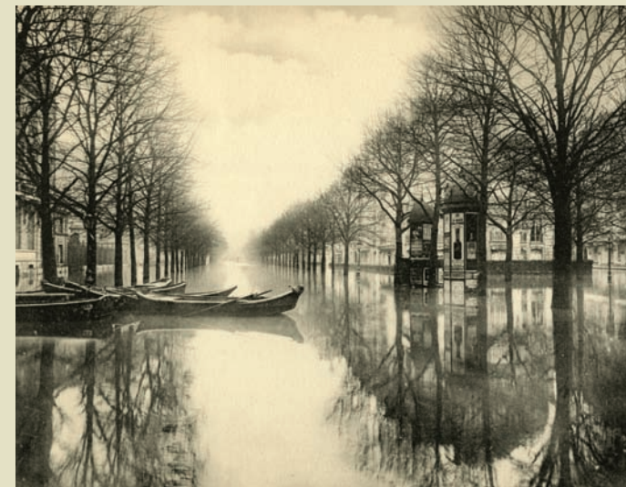
Boats tethered along the Avenue Montaigne in Paris during the flood.

Finally, the collection houses a very rare folio-sized book called Paris inondé: la crue de janvier 1910 (Flooded Paris: The High Water of January 1910) published by a leading Parisian newspaper. It tells the story of the flood in words, but the pictures it provides are some of the most powerful of any I've seen throughout all my research. They show the entire range of Paris' experience during the flood, from the pain of devastation to the intense drama of rescue to the hard work of rebuilding.