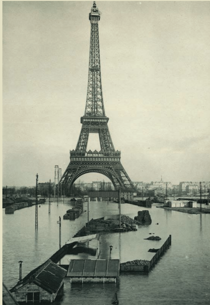
Houses and buildings mostly underwater are shown in the foreground, with the famed Eiffel Tower in the background during the flood on 1910.

When dozens of photographers went into Parisian streets documenting the tragedy, they captured hundreds of dramatic images. Many appeared in commemorative booklets sold for one franc even while the waters were still high. These printed compilations of a few dozen photographs per booklet served as a tangible memento of the flood for those who lived through it. Seeing the