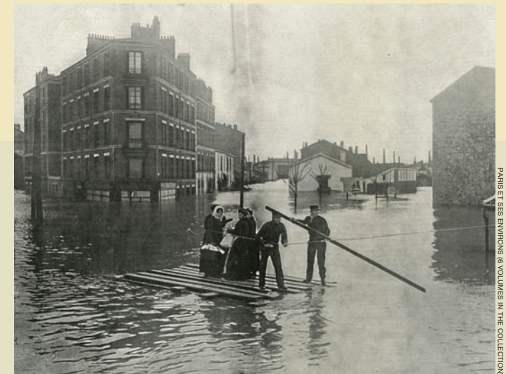
A raft carries some Parisian ladies to safety during the flood of 1910.

Of course, the whole story of the 1910 flood is more complicated, involving looting and hoarding as well as scenes of rescue and neighbors lending a helping hand. But the pictures have survived as evidence of Parisians at their best and how they came together to save their city in a moment of crisis.