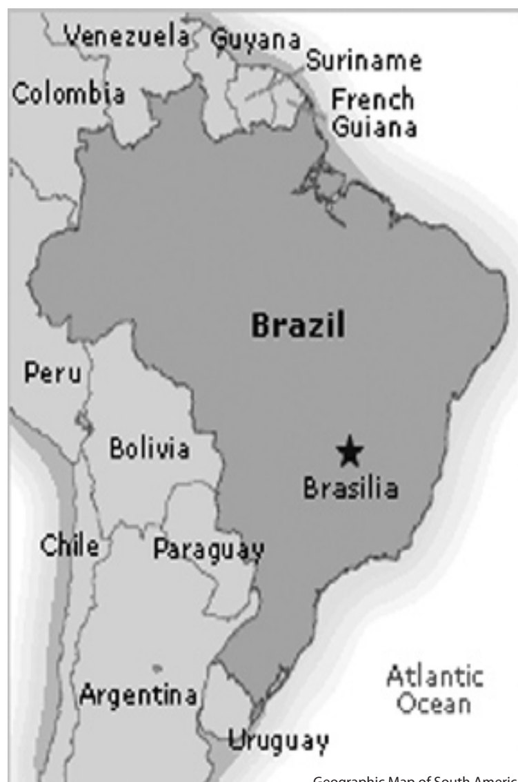
Geographic Map of South America

To remedy this situation, Brazil looked to American universities' policy of affirmative action to redress past discrimination. Many colleges and graduate schools in Brazil have begun implementing racial quotas to bring groups who were virtually unrepresented in academia into these institutions. The controversy surrounding Affirmative Action in the U.S. has now begun in Brazil with other additional dimensions. The country now struggles to define who is Black and who is White, often times with students newly adopting America's sacred one-drop rule. Brazilian society is becoming more "racialized" and so the effects of the newly implemented policy of Affirmative Action have not yet been determined.