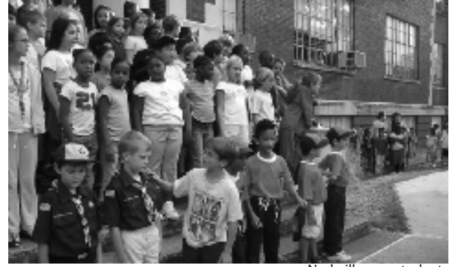
Nashville area students