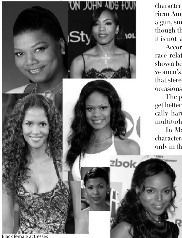
Black female actresses

B lack women certainly have a presence in the media today. Whether it be on television, in movies, or on the radio, they certainly make their presence known. In film, there