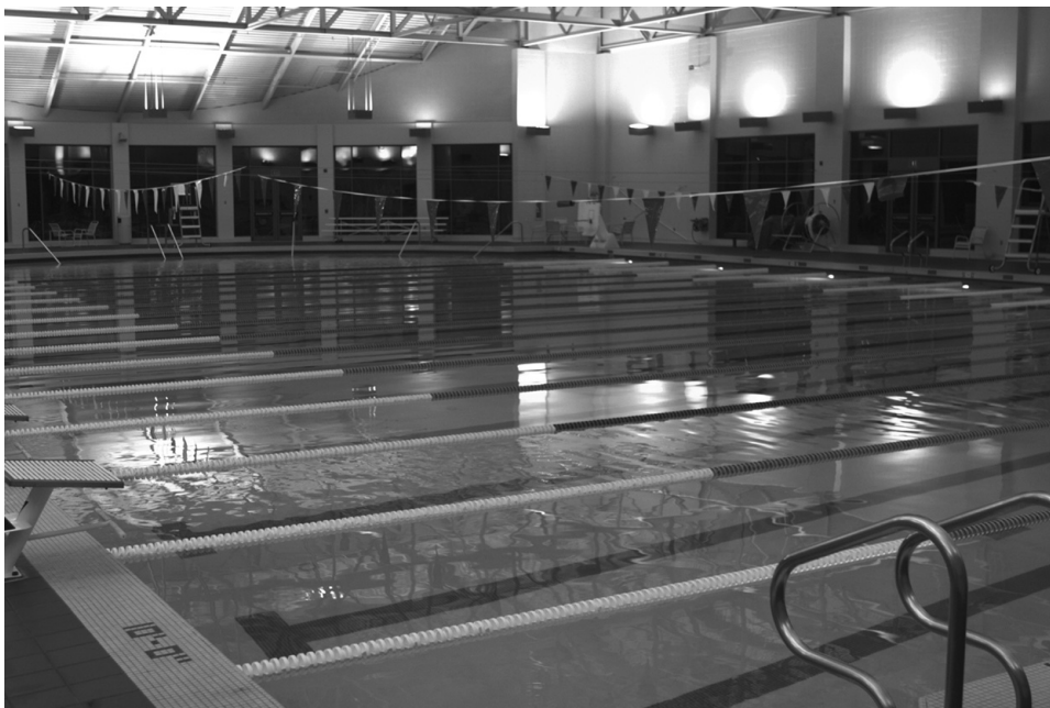
Centennial Sports Complex Pool

of lack of funding and opportunities to progress. As a fellow collegiate athlete, he can empathize with teams that are facing issues of disbandment, but com-