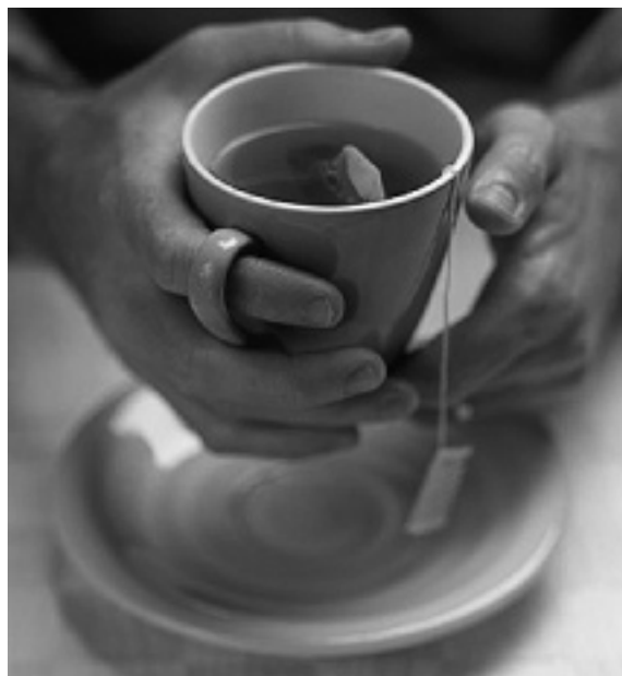
Tea relieves daily stressors

argue their case before a camera. During the tasks there was an increase in blood pressure and heart rate in both groups, factors that suggest a rise in stress hormone levels. About 50 minutes following the tasks, cortisol levels dropped by an average of 47 percent in the tea