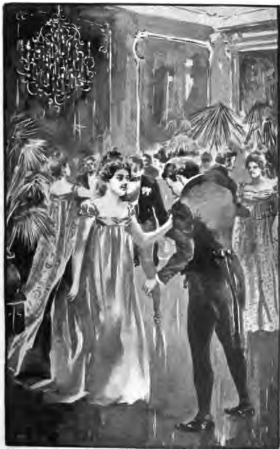
"There was a sound of revelry by night."—Page 135. Childe Harold's Pilgrimage.