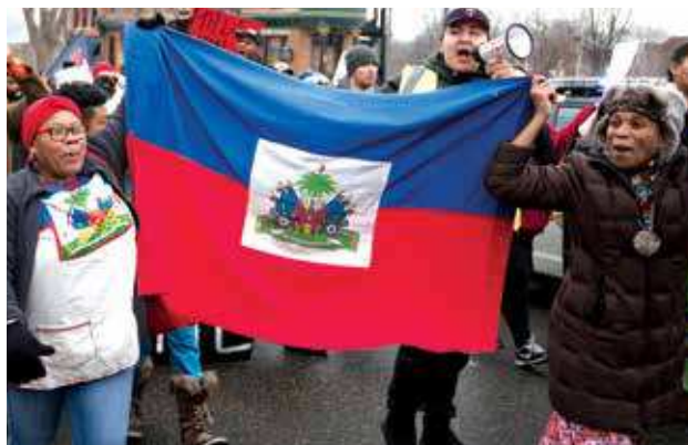
Around 500 people gathered in St. Paul, Minnesota, to march in support of immigrants and protest Republican President Donald Trump's immigration policies (January 20, 2018).

The Pew Research Center found that even though there has been a drop in the overall numbers of removals, the