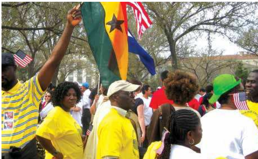
African immigrants at the March for America immigration rally in Washington, D.C., (March 21, 2010)

Ms. L's case, 21 Savage, and Opal Tometi expose the nuances of immigration policy at the intersection of nationality and race that are often glossed over in media stories highlighting this administration's con-