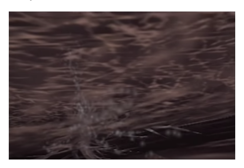
Fig. 10: A spatial plane?

Later, similar light quanta gather themselves into a brilliant stream that flows upward and into the roots of a tree-like object: