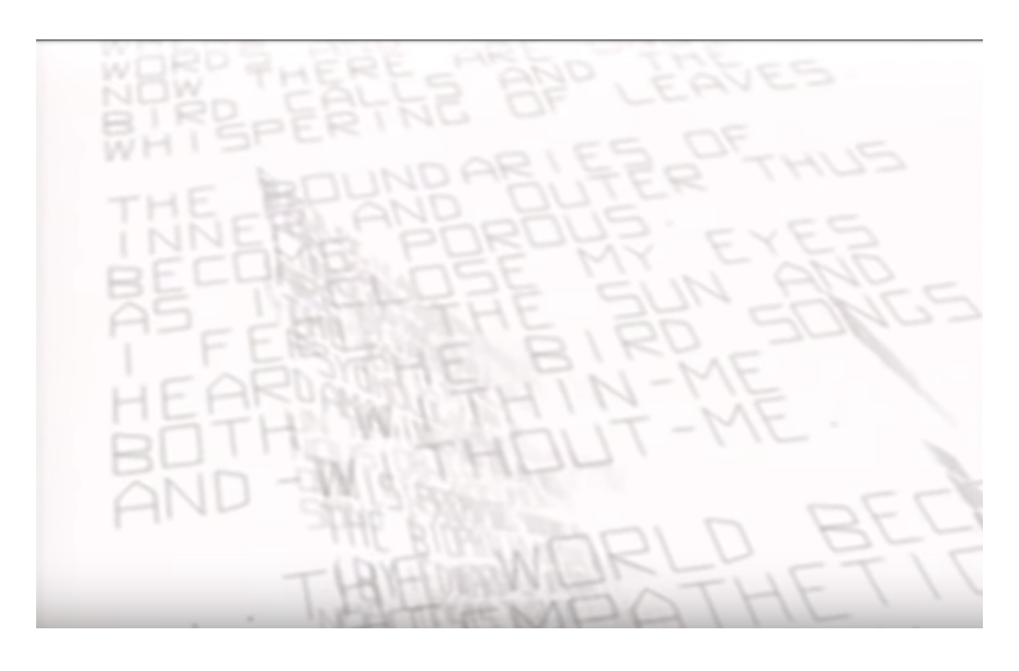
Fig. 11: Towering walls of words.

Code is a more specific instance of text, which appears elsewhere to the immersant in the form of massive sheets of poetry. In the following still, the text through which the immersant passes describes the very porosity that the virtual body traverses: