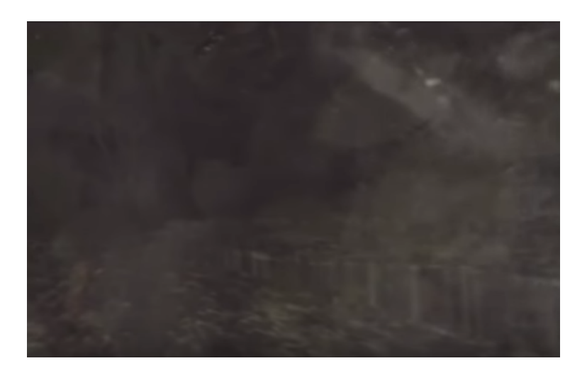
Fig. 6: Leaf-like objects coalesce from the immersant's vision.

Then, a multi-colored texture suggests a horizon or ground beneath and between the tree-like object and the immersant.