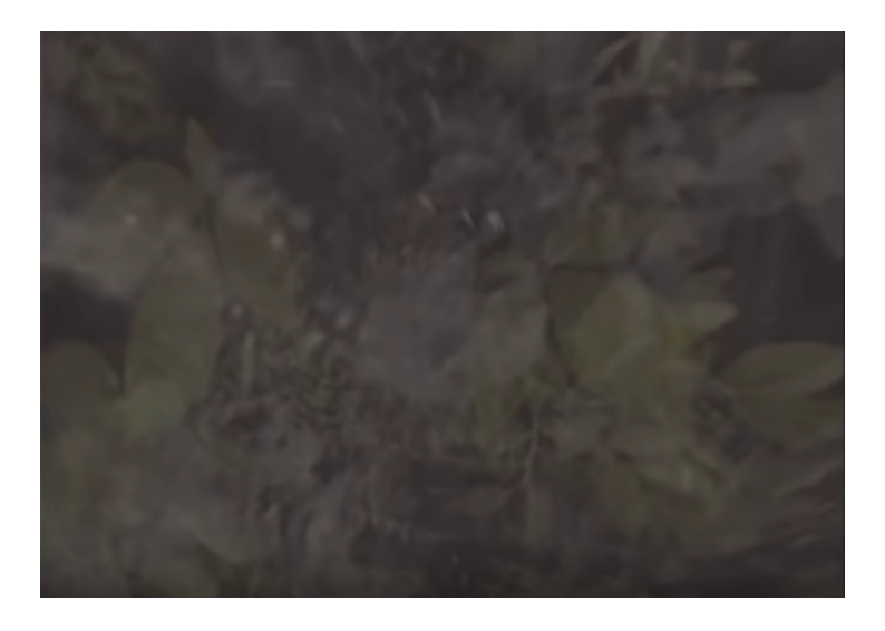
Fig. 7: Leaves appear more distinctly, though their porous boundaries remain.

Within a few more seconds, these faintly lit objects began to appear more distinctly. Their edges are more defined, their hues deepen and differentiate, and their shapes appear more sharply. Is the immersant in a forest? Davies describes this deliberate confusion as an experience of being "paradoxically enveloped by both realms at once." While the question of location is unavoidable for the immersant, the answer is not readily available based on the content of the vision. The multi-directional appearances of leaves, light, and darkness frustrate the subject's efforts to establish a sense of subjective location within a realm of objects: