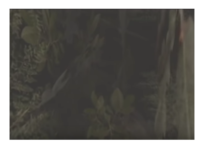
Fig. 8: Foliage and darkness.

As an aesthetic element in Davies's work, light also challenges the body's materiality and dissolves clear distinctions between subject and object. The "dissolution of form through light" about which Davies's writes not only blurs the forms of objects but the qualitative distinctions between subject and object. For instance, moments after the immersant passes into the realm of Osmose 's giant foliage, a stream of atomized light begin to flow toward the viewer. These units, which recall the notion of quanta even as they resemble certain western images of fairies, ultimately pass toward and through the viewer's body. The immersive body, in other words, is porous to light.