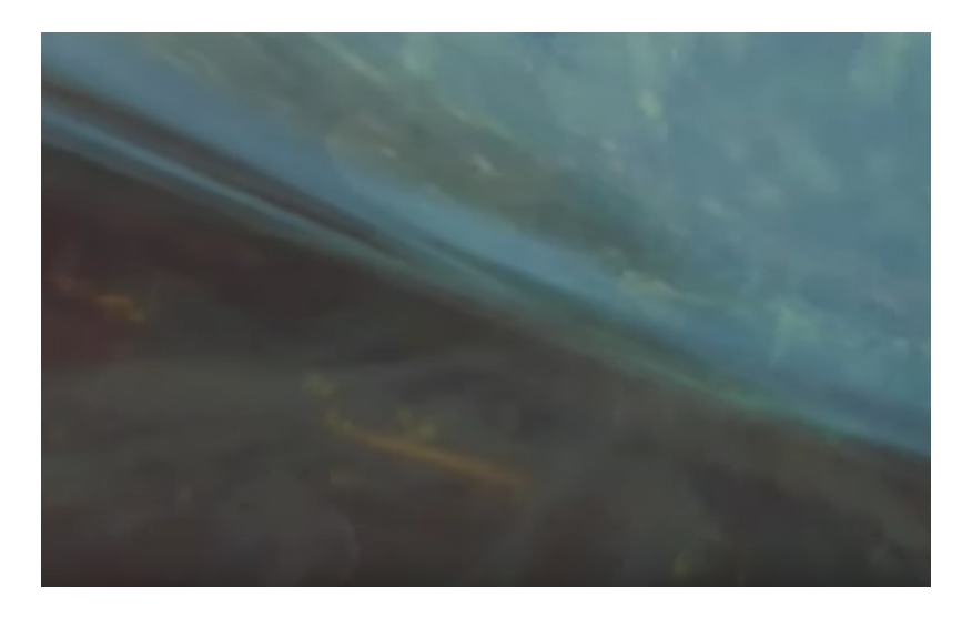
Fig. 17: A massive blue field.

Ephémère 's striking imagery shares Osmose 's formal penchant for depriving the immersant of identifying their sensorium as a stable center from which spatial relations may be discerned and controlled. Consider the following image captured from one immersant's experience: