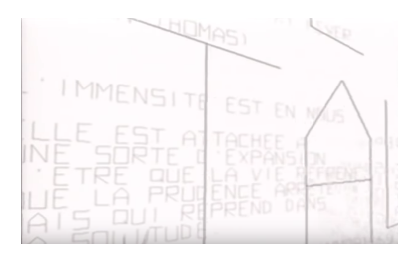
Fig. 12: Words of varying size rise up before the immersant.

Light appears as elemental quanta in Osmose , an aesthetic approach which we encounter again in Ephémère . In the later, however, light also takes on a more continuous and less discrete form than one observes in Osmose . The first objects that one encounters in Ephémère seem to consist almost entirely of light. It is as if these objects hover between solid and gaseous states, comprised as they are of brilliant waves of light. Light here does not appear in atomized units but rather as tendrils, walls, waves, and membranes whose variable luminosity creates the impression of different objects.