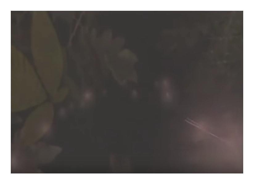
Fig. 9: The arrival of light.

Later, similar light quanta gather themselves into a brilliant stream that flows upward and into the roots of a tree-like object: