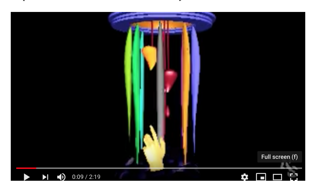
Fig. 1. Nicole Strenger's Angels.

In fact, the origins of participatory virtual reality had emerged over two decades before Eliassion's remarks. At the conclusion of the 1980's, Nicole Strenger created the "first immersive Virtual Reality movie": Angels . <sup>302</sup> Produced from 1989-1991, the brief video positions a viewer in a black space interrupted by the presence of multi-colored, unidentifiable objects. A disembodied hand floats among these objects. The hand does not so much inspect the objects with its digits so much as hover among them. The hand, it seems, is not quite a hand at all, not a manipulative force that extends the power of an embodied subject. Because the hand is detached from a body, it becomes an ambiguous object. Does the hand "stand for" the viewing subject's power to manipulate the contents of psychic experience? The strange object became an index for the possibilities associated with virtual reality as a form of art.