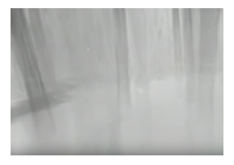
Fig. 3: A darkened wood?

The relation between Statius's claims and Dante's world may reflect a similar link between Davies's description of her own work and Ephémère itself. The opening text of the immersive video orients the viewer's understanding of the virtual environment's "realms." At every turn, however, the immersant encounters phenomena that challenge this neat distinction into three distinct zones. The same challenges to identity observable in Osmose prevail in Ephémère , only with greater intensity: Objects become translucent and pass through the immersive body of the subject; there is a distinct absence of spatial planes that would provide consistent borders, grounds, or horizons; and most distinctively, Ephémère —as the environment's title would suggest—contains even less objects whose morphology is clearly delineated by structural detail. The opening phases of the immersive world exemplifies this last point with its murky patchwork of white, black, and grey tones. These colors mingle and blend in defiance of distinction, even as they faintly suggest certainly partially recognizable objects such as trees and water: