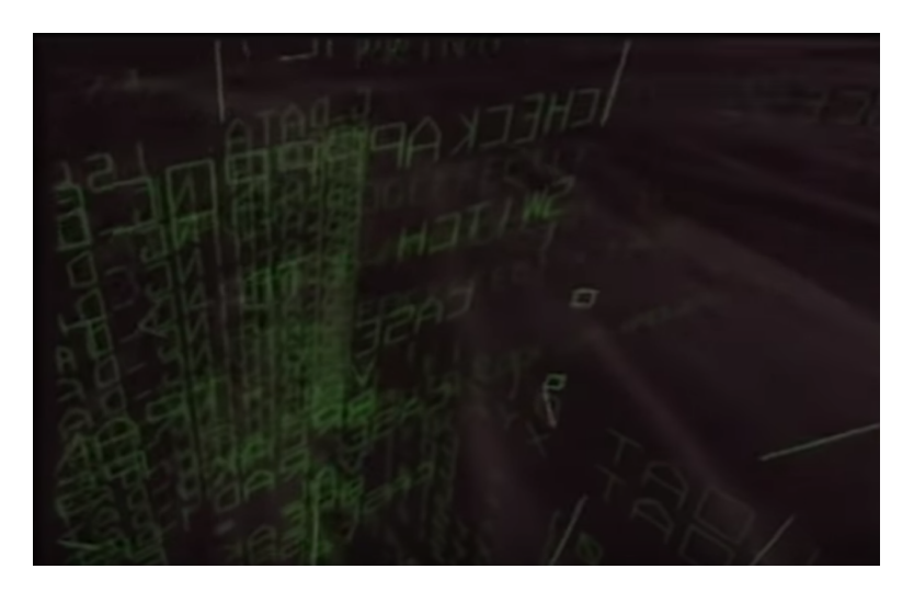
Fig. 10: Flowing sheets of digital code.

If light suggests a fundamental ethereality in Osmose , that suggestion is deepened in the subsequent user experience of coding language as a visual object. Immersants in Osmose pass through layers of biological-like humus and earth only to find themselves surrounded by the appearance of digital code: