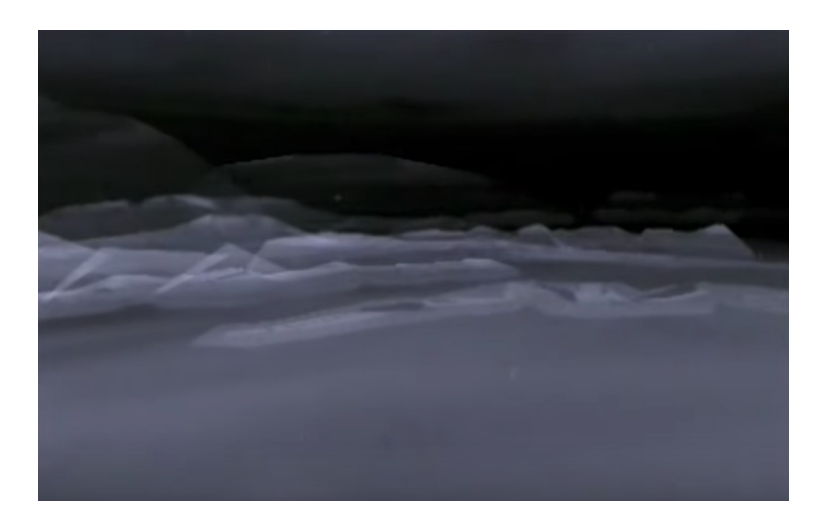
Fig. 15: A celestial environ?<sup>413</sup>

Ephémère is consistently characterized by a more somber and even unsettling atmosphere than the sublimity and tranquility of Osmose . Gray scale color schemes, the stark absence of color in the itinerary's initial portion, and the staccato of unnerving strings in the soundtrack all establish a mood that enhances the already destabilizing features of the visual environment. The unsettling atmosphere of disorientation climaxes with the immersant's position in a terrain that forces a sense of solitude.