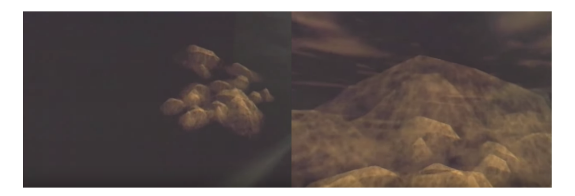
Fig. 16: Objects marked by increasing spatial distinction.

Ephémère 's striking imagery shares Osmose 's formal penchant for depriving the immersant of identifying their sensorium as a stable center from which spatial relations may be discerned and controlled. Consider the following image captured from one immersant's experience: