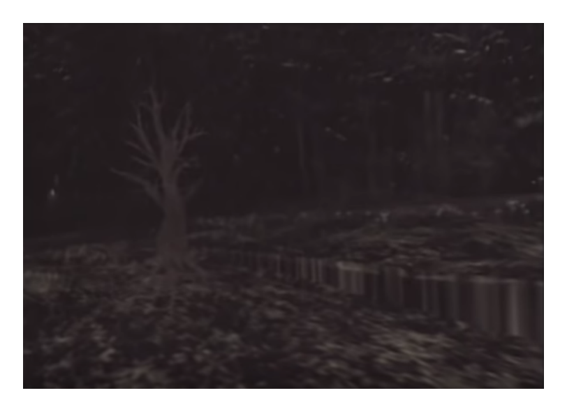
Fig. 5: Something resembling a tree emerges against a shifting ground.

Here, the immersant's perception of a tree-like object is suddenly shifted by the presence of a white light that throws the image into relief in a way redolent of observing a film negative.