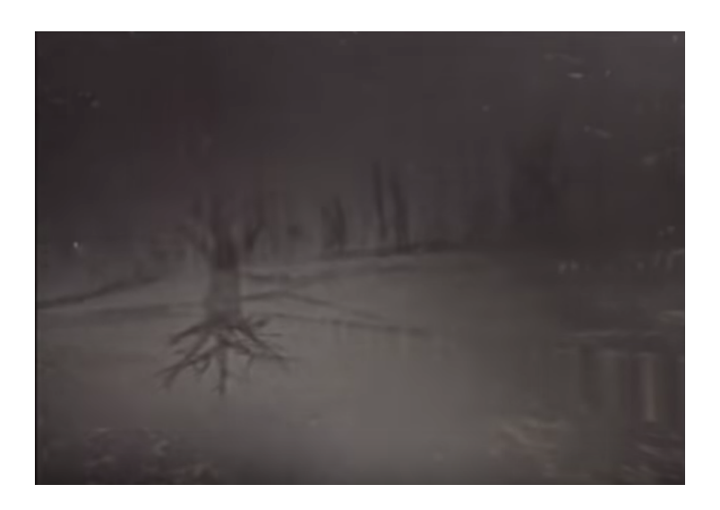
Fig. 4: Baroque contrasts of grey, black, and white frame mysterious objects.

In Davies's art, light often serves as an environmental transition. In Osmose , the equivalent of lens flares (moments when light beams saturate within a frame of vision creating a brilliant flash) can sometimes create a temporary moment of blindness. When the immersant's vision is restored, it is clear that the immersive body has passed into a different environment. Davies herself describes her artistic efforts to fashion the "dissolution of form through light." Consider the following sequence of images taken from the video log of one immersant's experiences in Osmose :