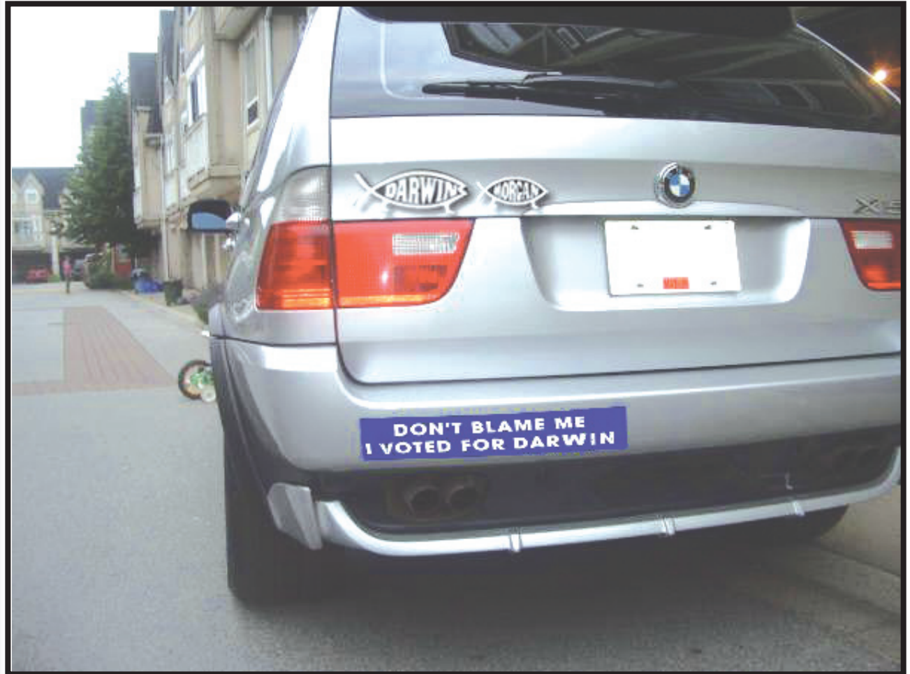
The Slant spotted this car last week in the Vanderbilt area.