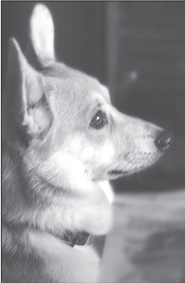
The Pembroke's upright ears are distinctive.