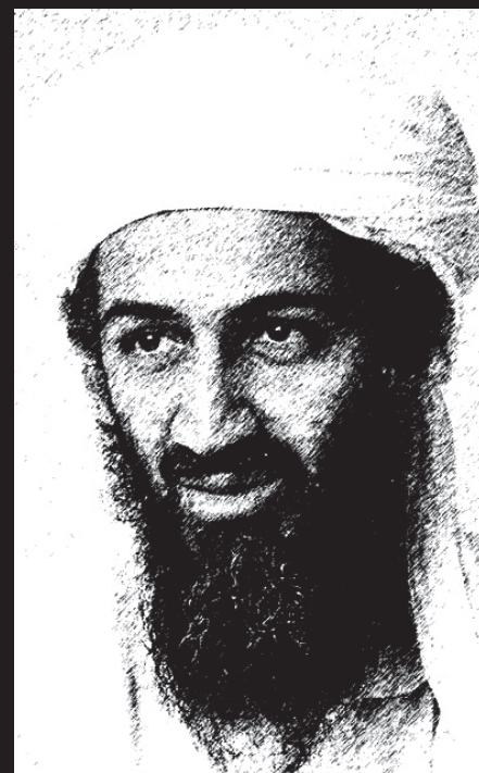
VUPD released a sketch of the suspect.

ence and the gun laws are more conducive to our activities. From there we will spread across the land leaving behind annoying fires before running to hide as we bravely carry out our Jihad". Bin Laden was last seen at a local free dialysis clinic which was subsequently bombed "just in case."