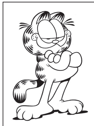
The offending cartoon.