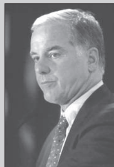
Howard Dean, Rolling Stones Fan

What do you do when you can't think of "Around The Loop" questions?