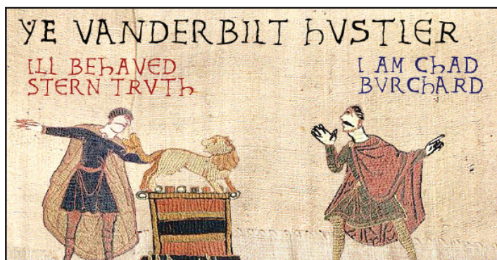
Zounds! The starter image!

We asked the staff to create their own tales with the program at http://www.adgame-wonderland.de/type/bayeux.php .