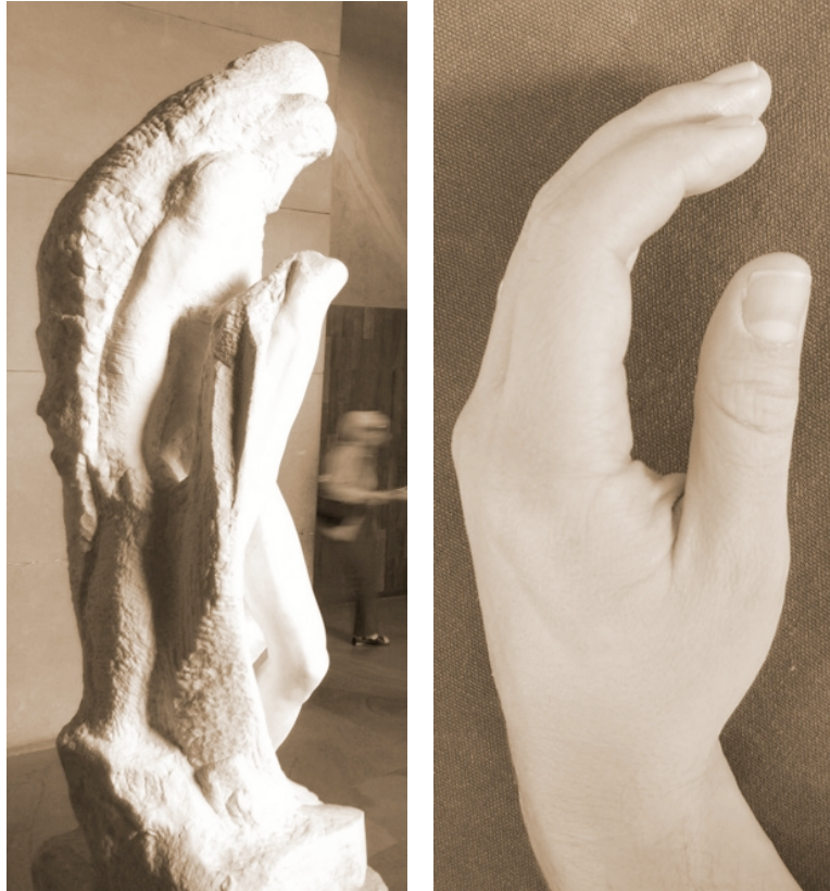
Figure 9 The Rondanini Pietà as a hand