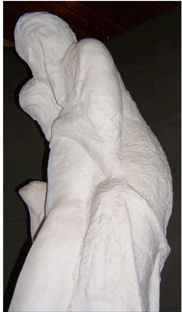
Figure 6 The Rondanini Pietà

[An] ambivalent and tormented struggle in Michelangelo, embodied in his Marys and dead Christs, drove him, in the Rondanini, to his final transcendent image of the fusion of the Son and Mother, each consisting of parts carved out of the other, in which even the forces of gravity are disregarded, boundaries are obliterated, and the two are timelessly reunited. 544