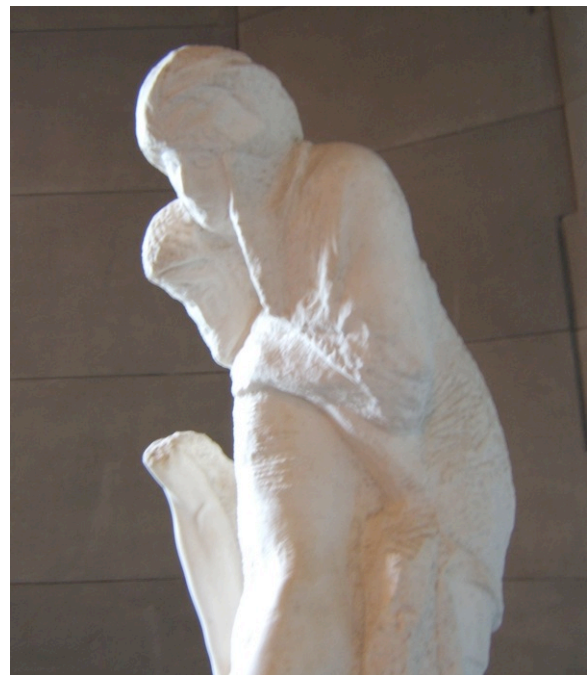
Figure 5 The Rondanini Pietà

Similar to ORT—with its emphasis on the importance of early relational dynamics with the primary caregiver—is attachment theory, which