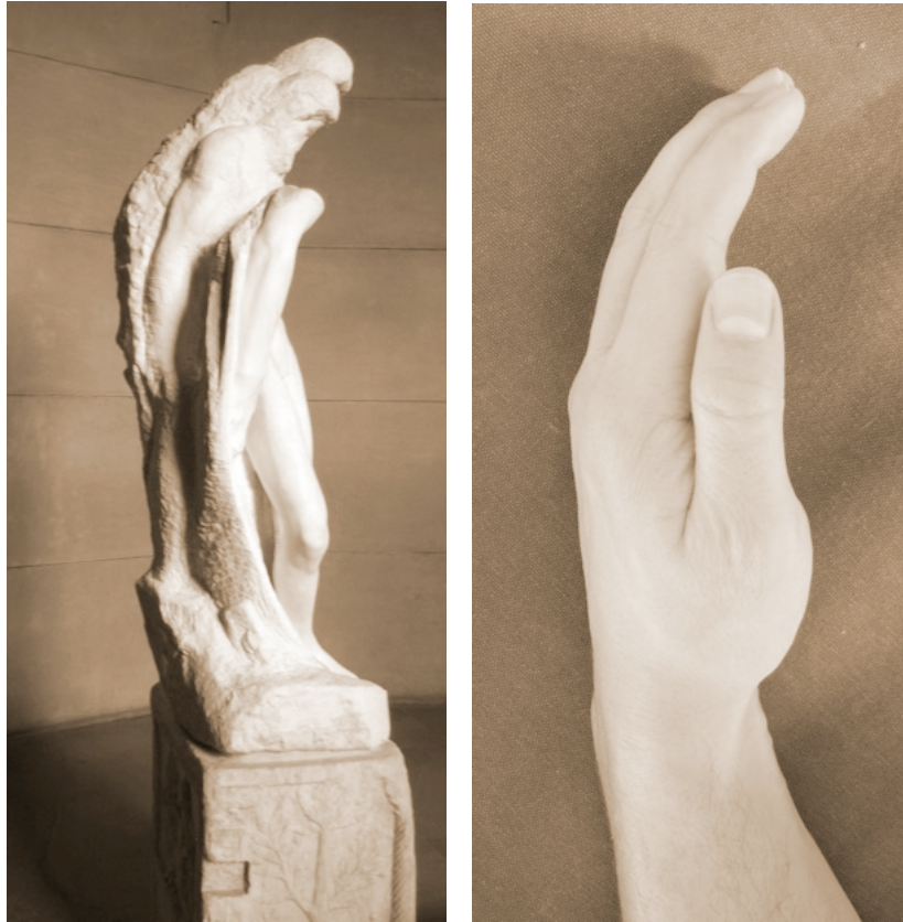
Figure 11 The Rondanini Pietà as a hand (right view)