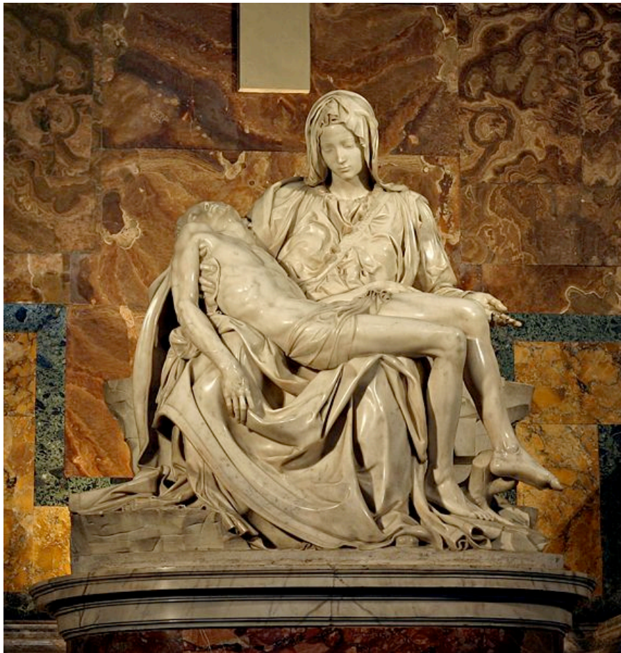
Figure 2 The Vatican Pietà

While still a young artist with a growing reputation, Michelangelo made the acquaintance of a Roman banker and art lover, who offered him a room in his home and for whom Michelangelo sculpted a Bacchus and then another Cupid . 92 This same Roman banker then also secured a commission for a work, which he promised, in writing, would be “the most beautiful work in marble to be found in Rome and no master will make a better one.” 93