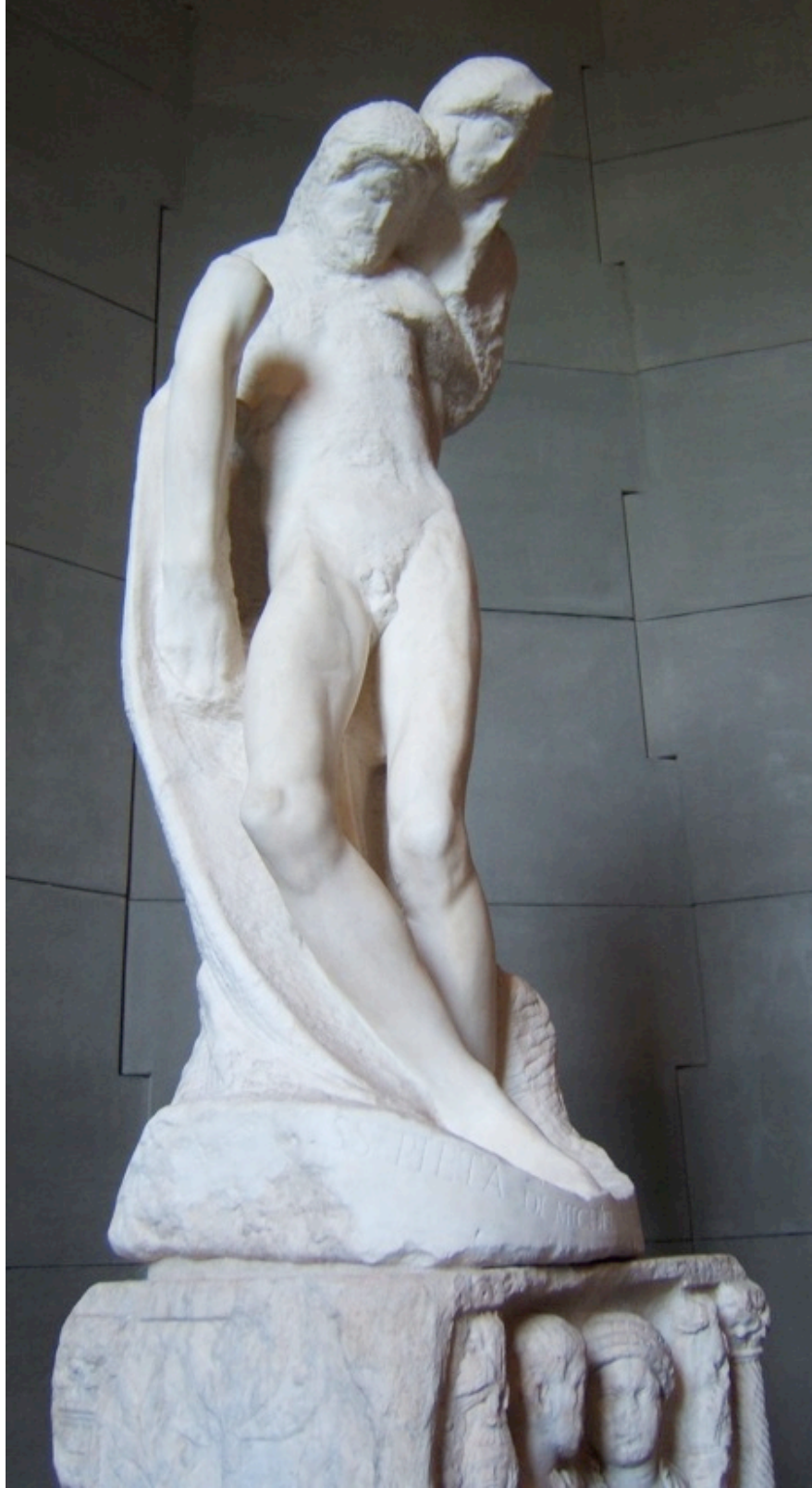
Figure 12 The Rondanini Pietà