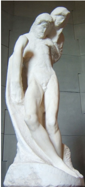
Figure 1 The Rondanini Pietà

Given America's increasing geriatric population, the dearth of sustained and methodological