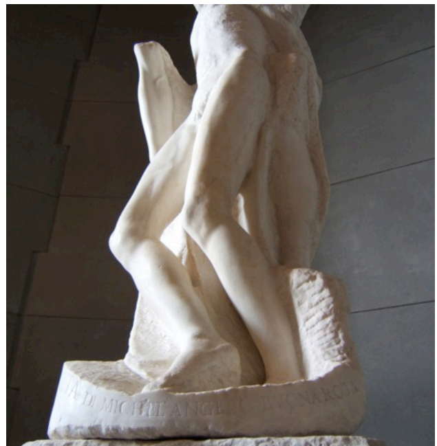
Figure 8 The Rondanini Pietà (Mary's calf on the right)