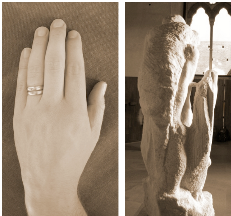
Figure 10 The Rondanini Pietà as a hand (rear view)