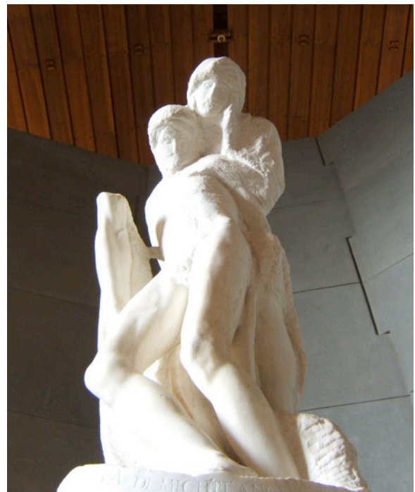
Figure 4 The Rondanini Pietà

An even less reliable reference comes then almost a hundred years later in 1739 in the vague description of a “petite et admirable” group of Joseph of Arimathea Supporting the Dead Christ attributed to Michelangelo. 276 Given the unfinished nature of the Rondanini Pietà , it is conceivable that one can see the Mary figure as Joseph, but in addition to this departure from the