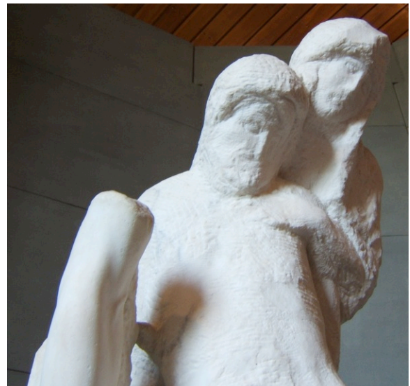
Figure 7 The Rondanini Pietà (vestigial arm)

The vulnerability has also to do with some of the figures’ surprising nudity. First, Jesus is fully exposed, but this was a common trope for Michelangelo that also had a long iconological precedents in secular sculpture, especially those of Greek and Roman sculpture that Michelangelos had studied. Second, and perhaps more surprising, is the vulnerability