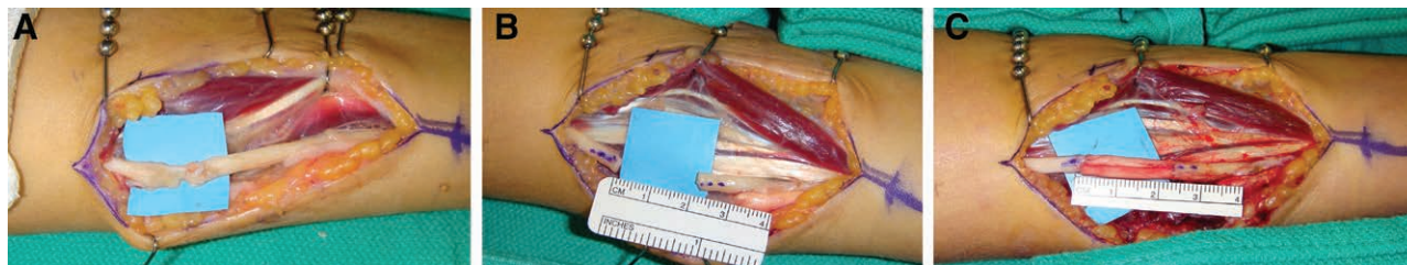
Fig. 1. Injury and repair of an ulnar nerve with PNA. A, 16-year-old girl presented to the clinic in a delayed fashion with a low ulnar nerve palsy after accidental laceration to the left forearm with a pocket knife. Surgical exploration 41 days after injury, the flexor carpi ulnaris and ulnar neurovascular bundle was nearly completely transected and encased in tremendous amount of scar. B, Neurolysis of the ulnar nerve and resection to healthy fascicles resulting in a gap length of 23 mm. C, Following repair using two 3–4 mm diameter PNA in a grouped fascicular fashion.

in rate of meaningful recovery. Statistical significance was set at a probability of type I error less than 0.05 ( P < 0.05 ).