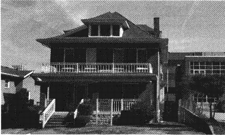
FIGURE 1. Music Row

At first glance, fights over the future of Music Row look entirely conventional. Groups arrayed against the development include NIMBY neighbors as well as preservationists. One of the most hard-fought development battles on Music Row concerned RCA Studio A. In 2014, when a developer announced plans to tear down and redevelop the property, singer-songwriter Ben Folds wrote an open letter to the musical community imploring that the building be saved. 104 He listed the musicians who recorded hit records there, including The Beach Boys, Dolly Parton, Jewel, Kesha, Hank Williams Jr., and many, many others. Folds was himself the tenant at the time, and he organized an aggressive and ultimately successful effort to buy the building and preserve it as a recording studio. 105