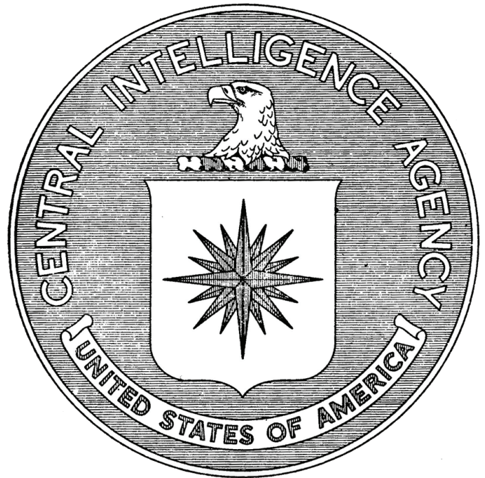
Seal of the CIA (1950)

Dulles knew no truths aside from the ones he fabricated himself, and knew no enemy aside from the ones he crafted in his own war on the world. Dulles did not use intelligence to fight for the preservation of democracy and America—rather, he fashioned intelligence to be able to play the political mas-