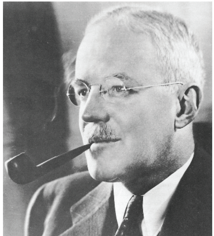
Allen Welsh Dulles

From this lesson came Dulles' knowledge that an alliance with his brother could bring him great success, but the competition with his brother was a fine line that had to be maneuvered carefully if he was to ultimately become more successful than John. From being left at home while John went abroad just before he went to Princeton to his entire Princeton experience at John's alma mater, Allen attempted to