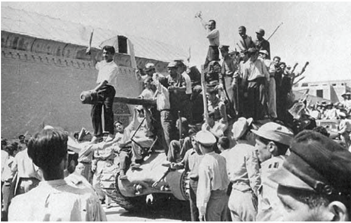
Tanks in the streets of Tehran (1953)