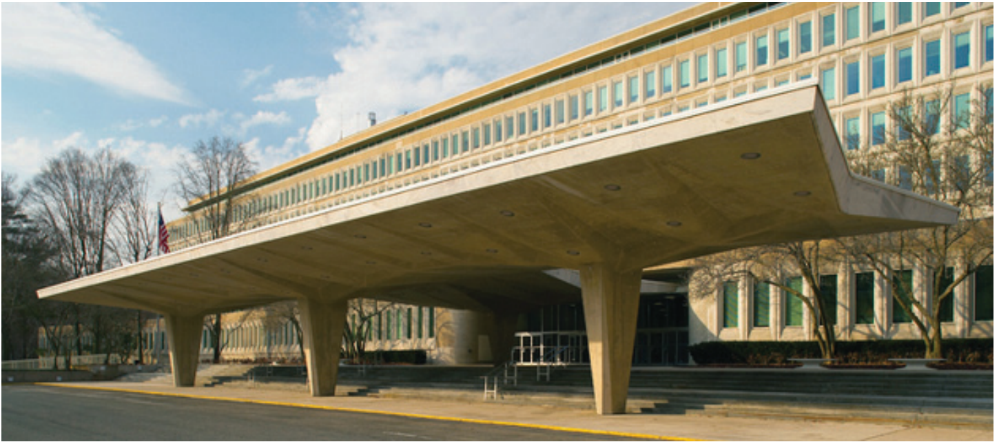
The CIA Original Headquarters Building (OHB) in Langley, VA (2014)