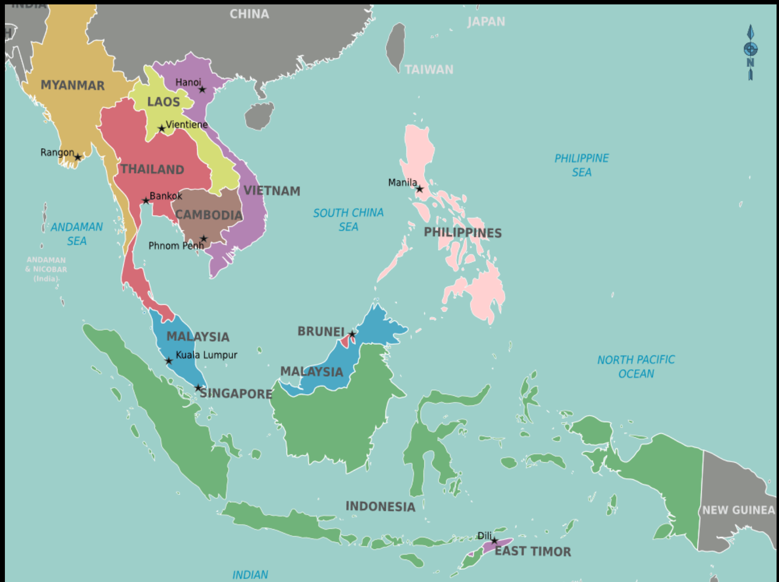
Map of Southeast Asia