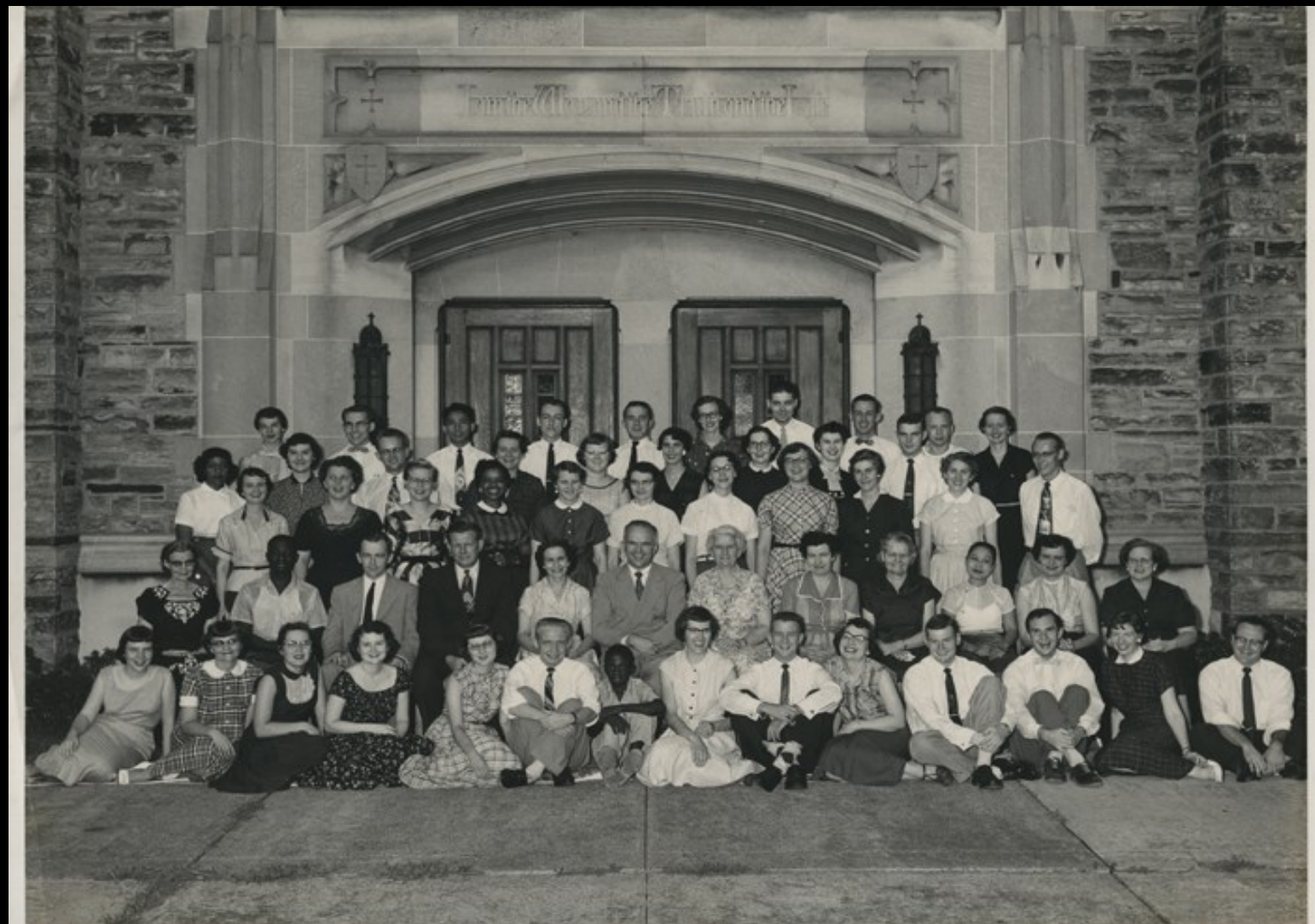
Dot with other teachers received training at Scaritt College (a.k.a. Scarritt/Bennett Center)