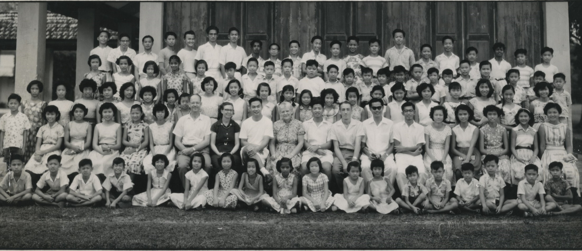
Students and teachers of the Sitiawan Sunday School