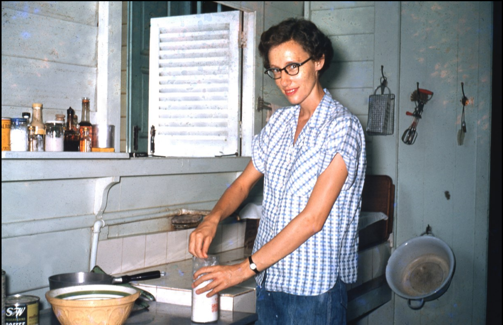
Making milk from milk powder