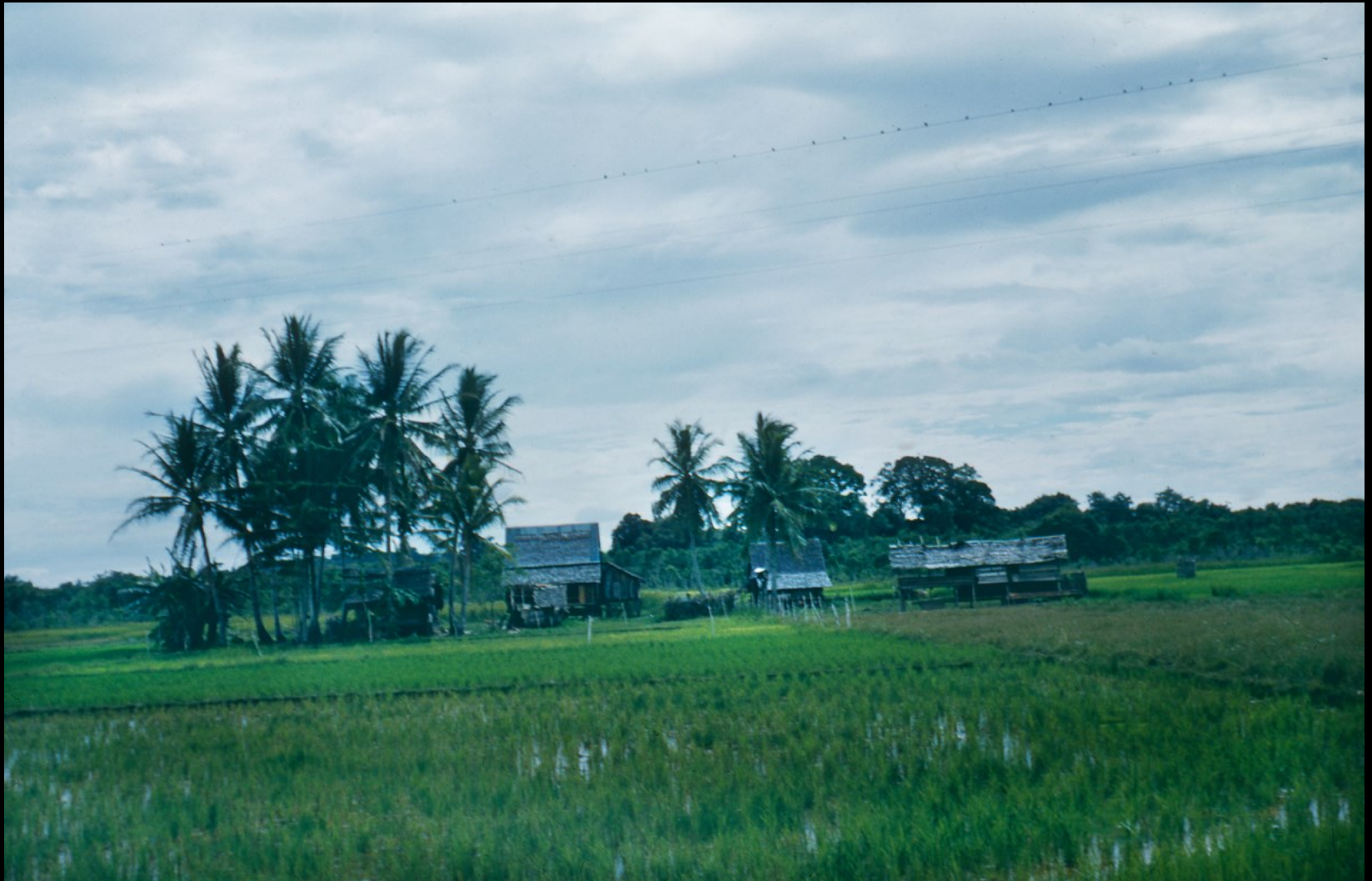
Malay huts surrounding the rice paddy