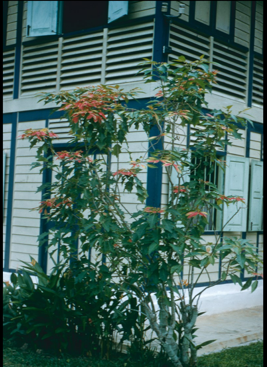
Poinsettia next to the mission bungalow