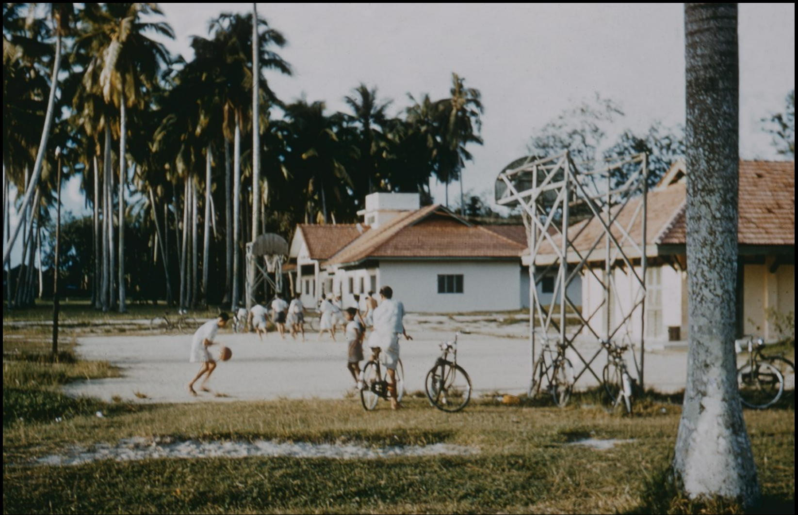
Basketball court behind the Anglo Chinese school