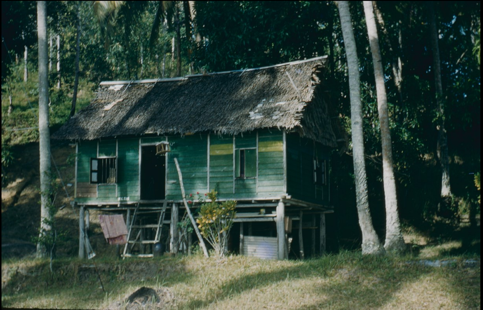
Malay house built on stilts and topped with atap