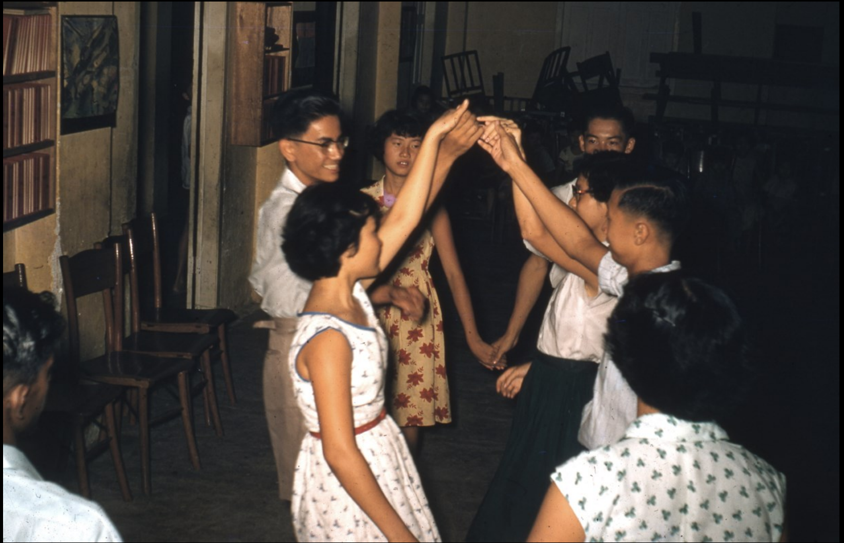
Folk dancing in a students social gathering