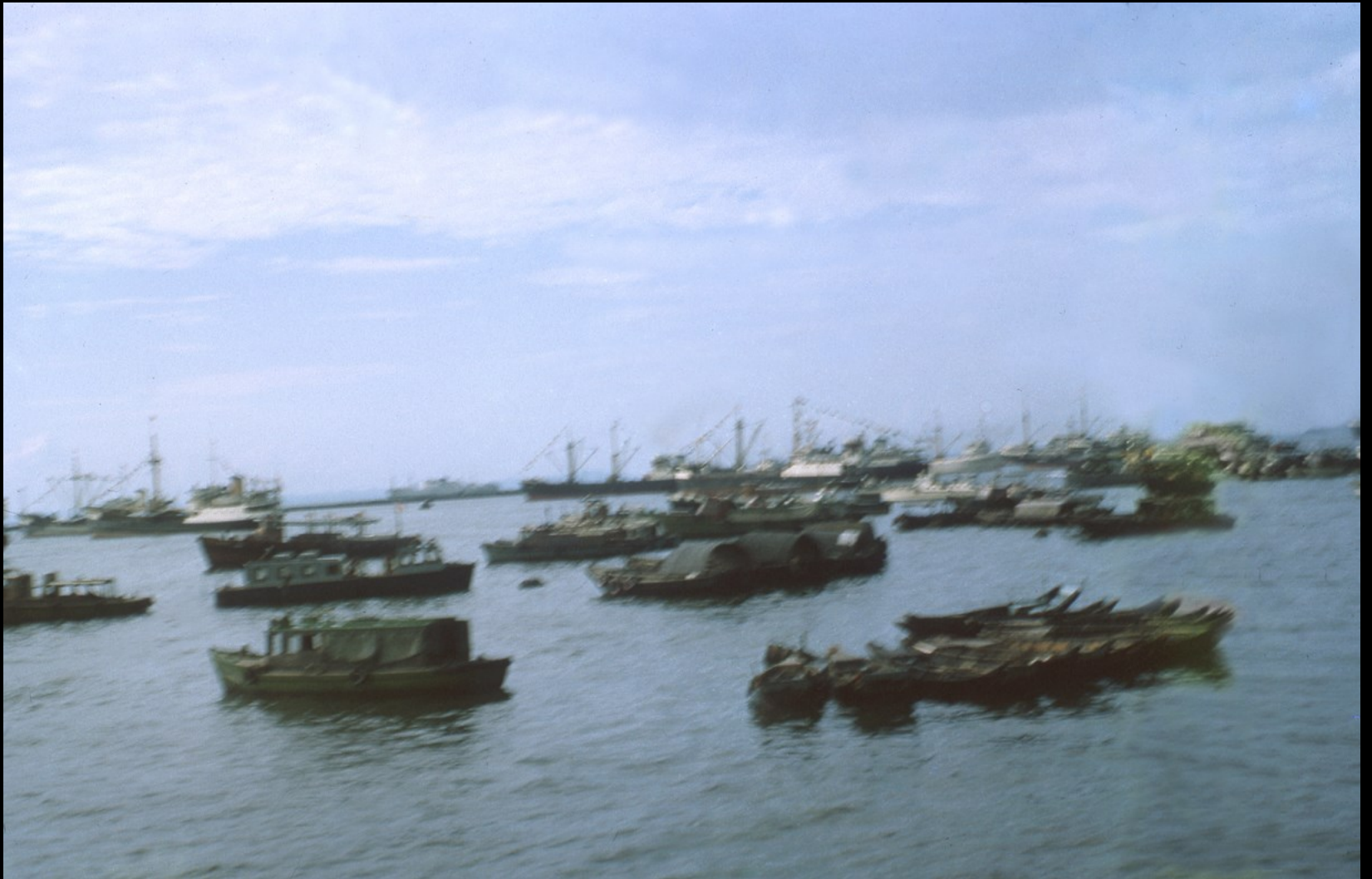
Chinese junks outside of Hong Kong