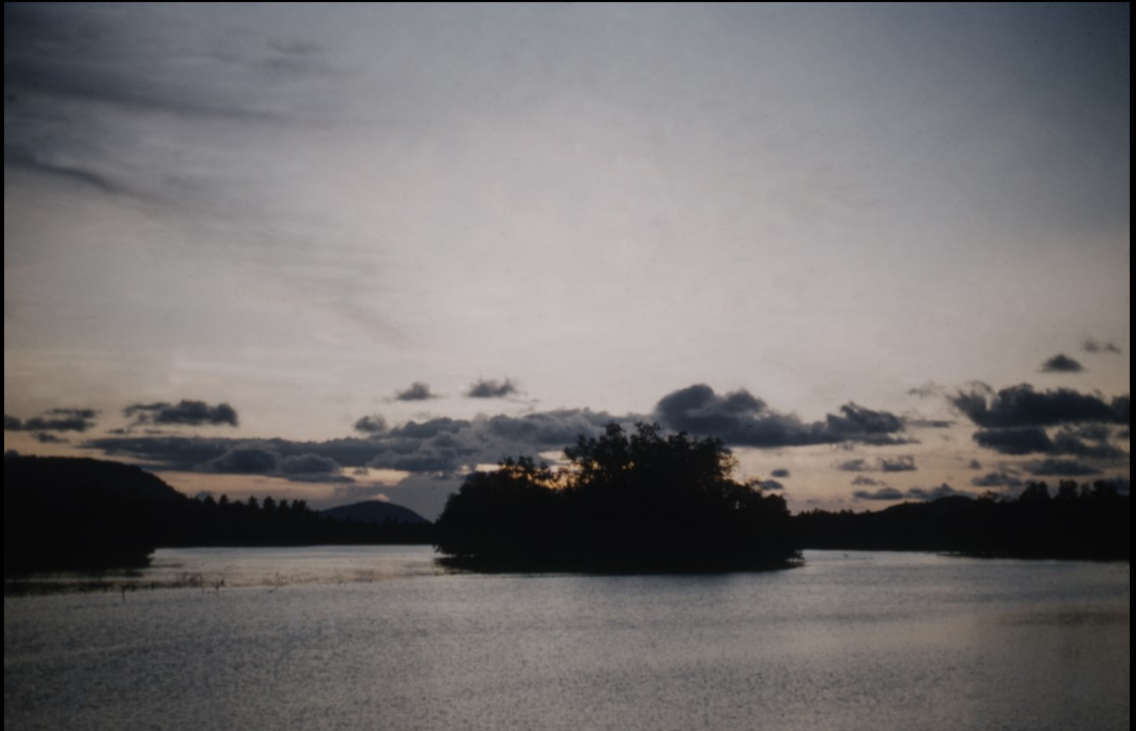
Small island on the west coast of Malaysia