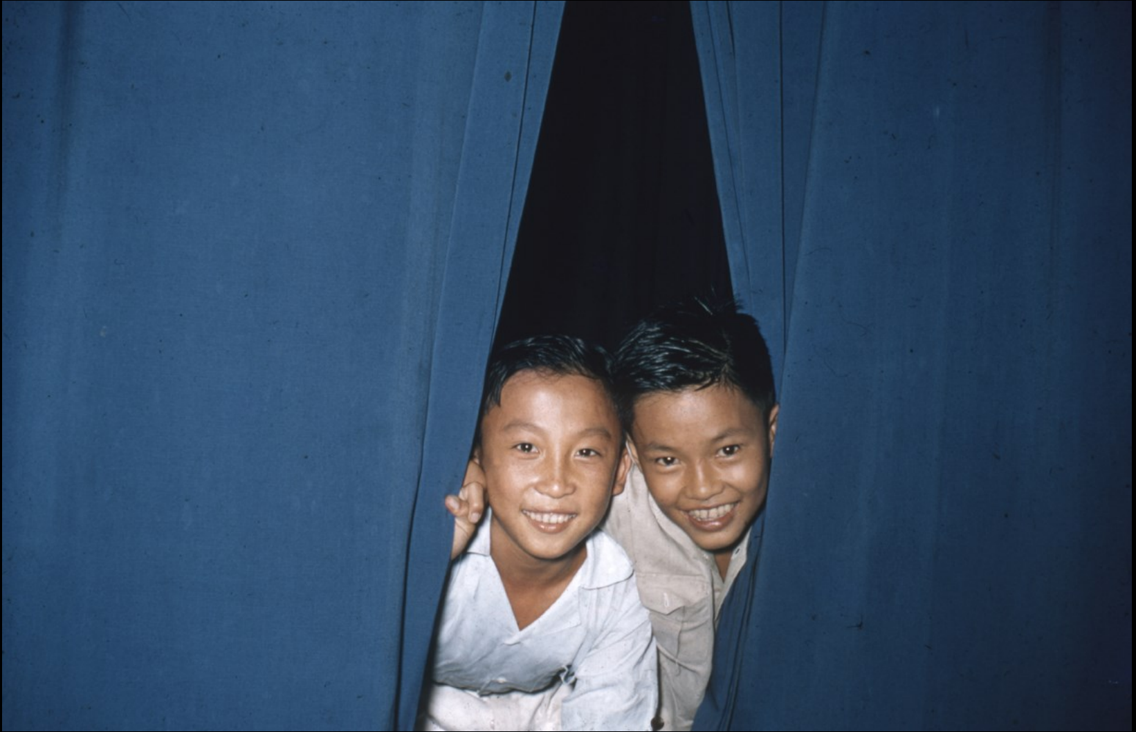
Students from the Vacation Bible School