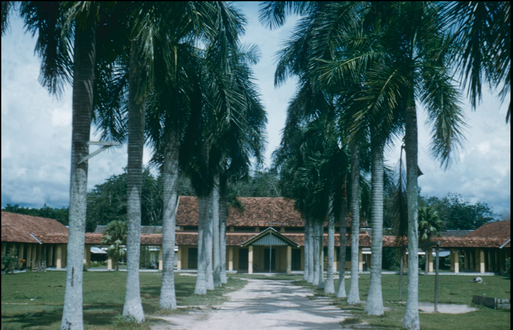
Palm trees in front of the Anglo Chinese School