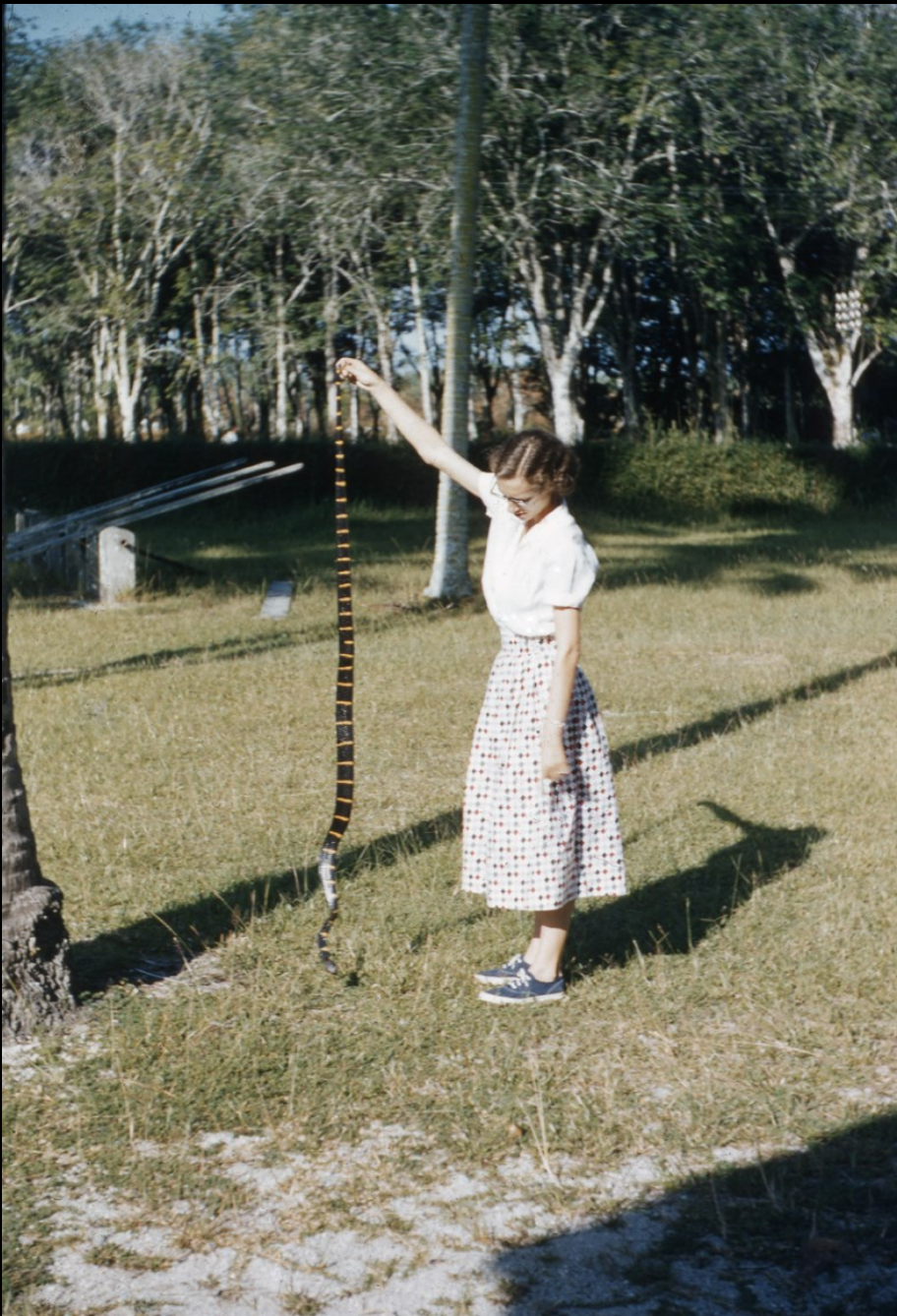
7 feet long dead snake found on the roadside