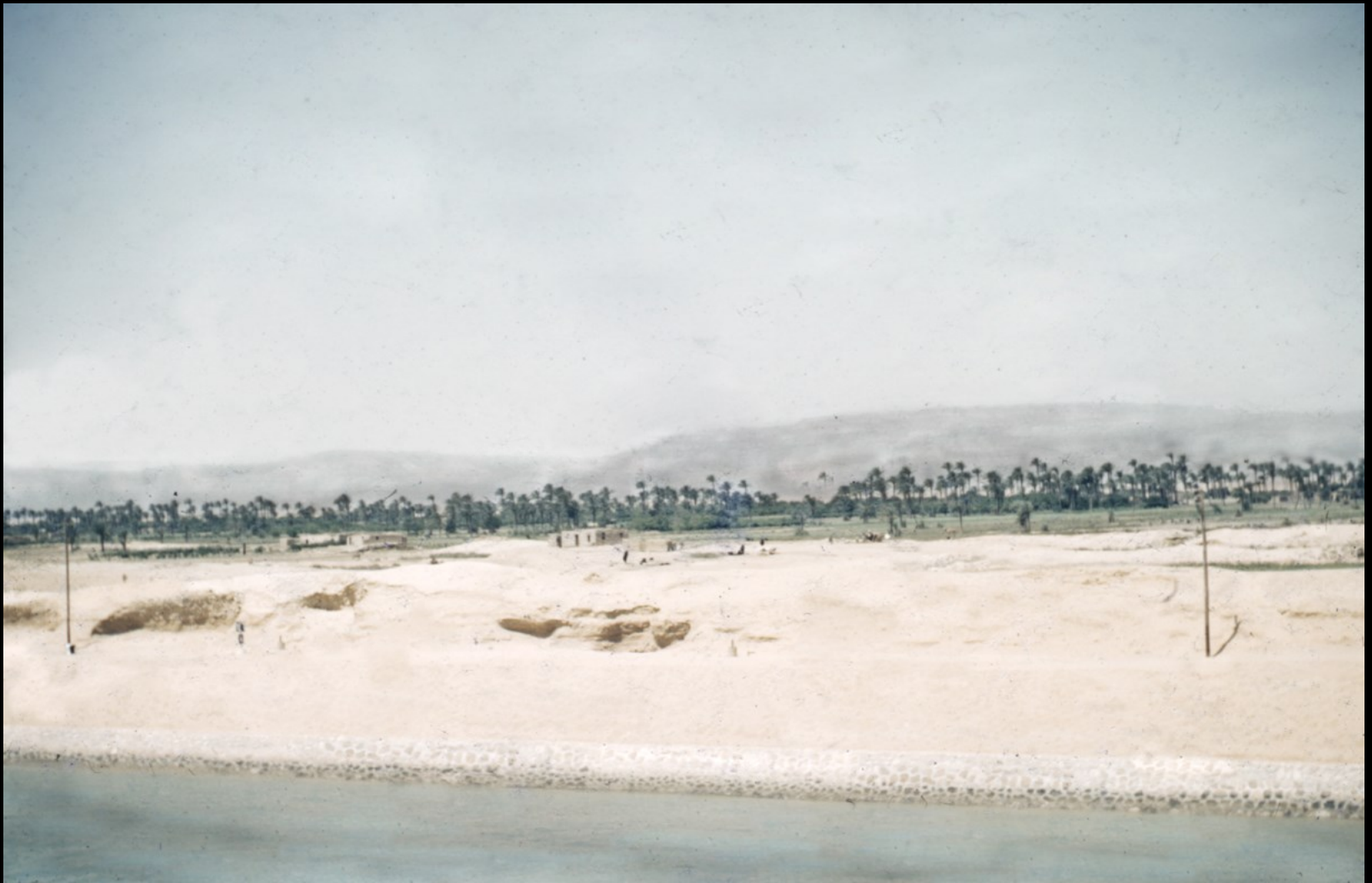
Along Suez Canal