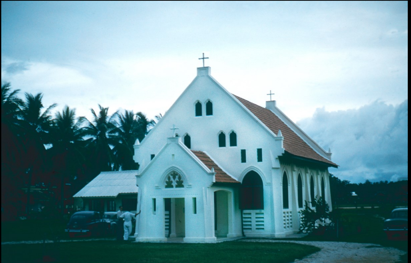
Sitiawan Wesleyan Church for English speaking congregation