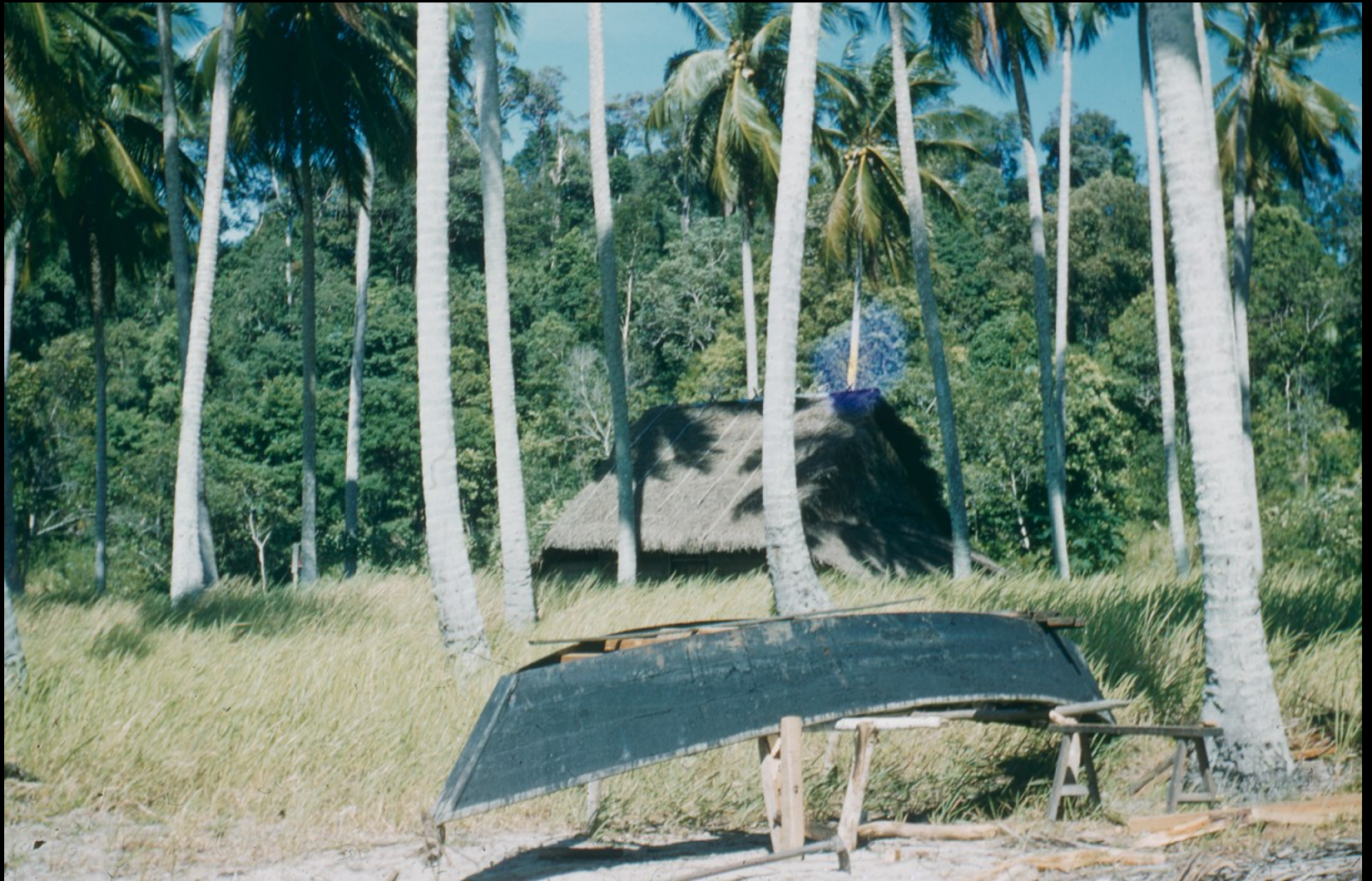
Malay boat and hut