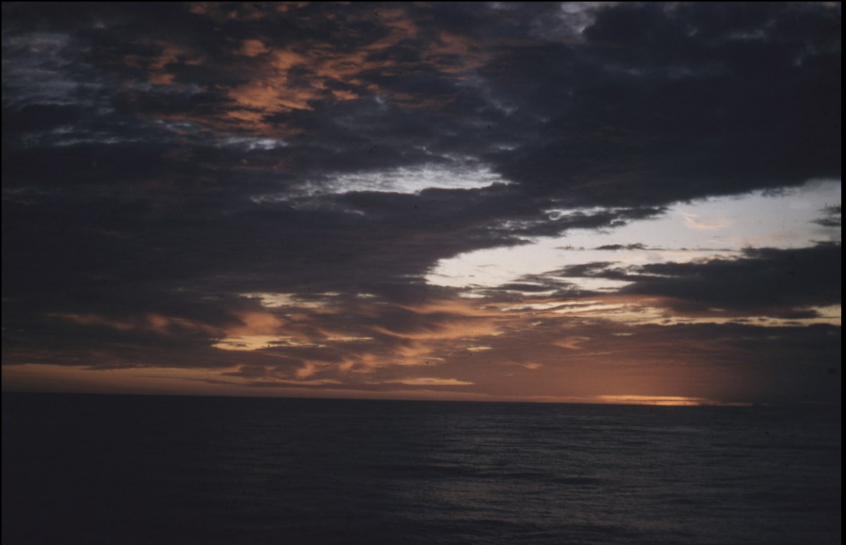
Sunset on the Pacific Ocean