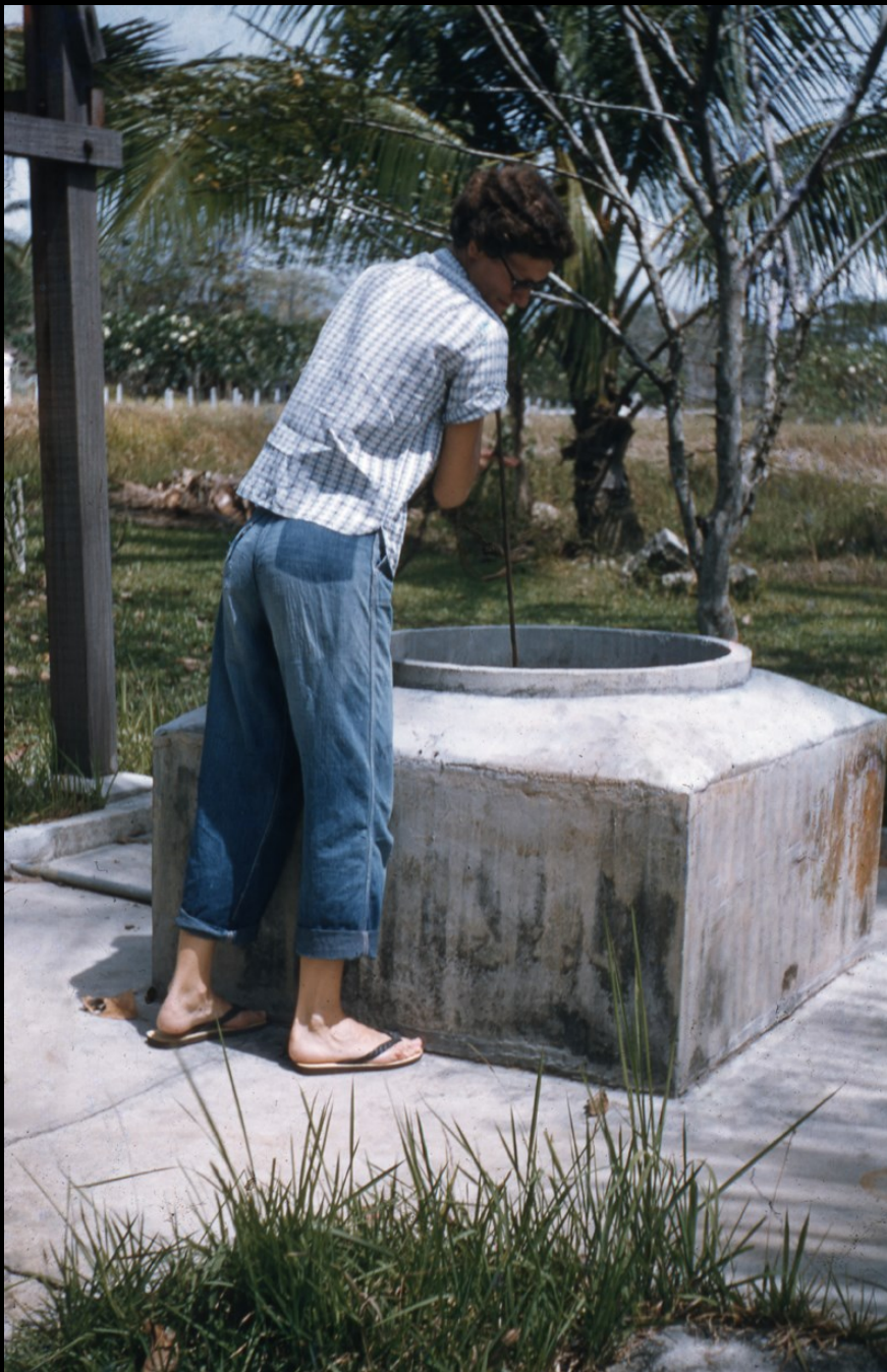
Getting water from a well