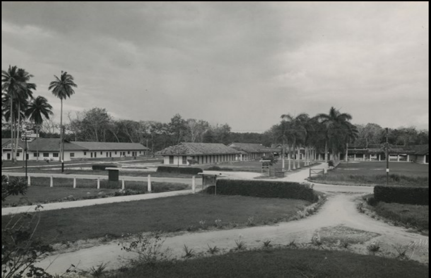
The overview of Anglo Chinese School