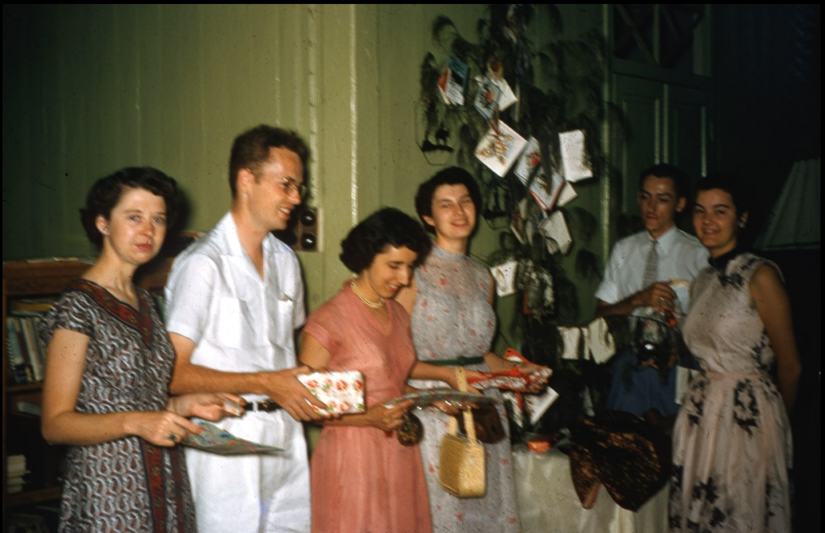
First Christmas in Malaya