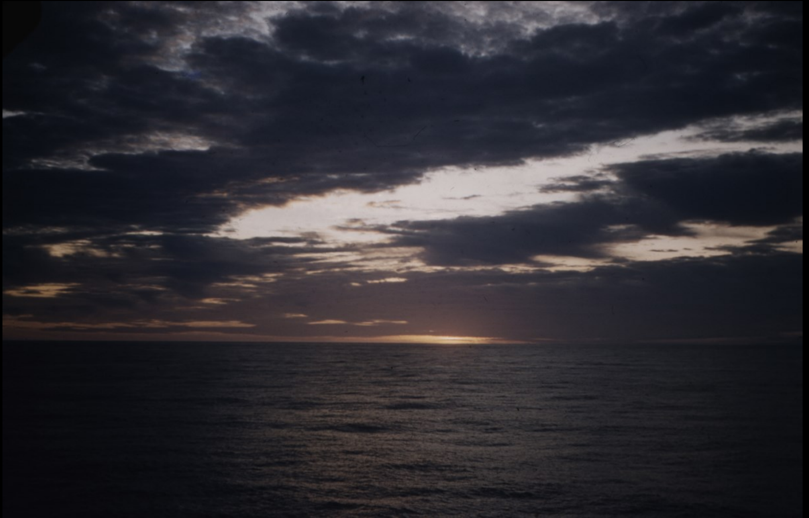
Sunset on the Pacific Ocean