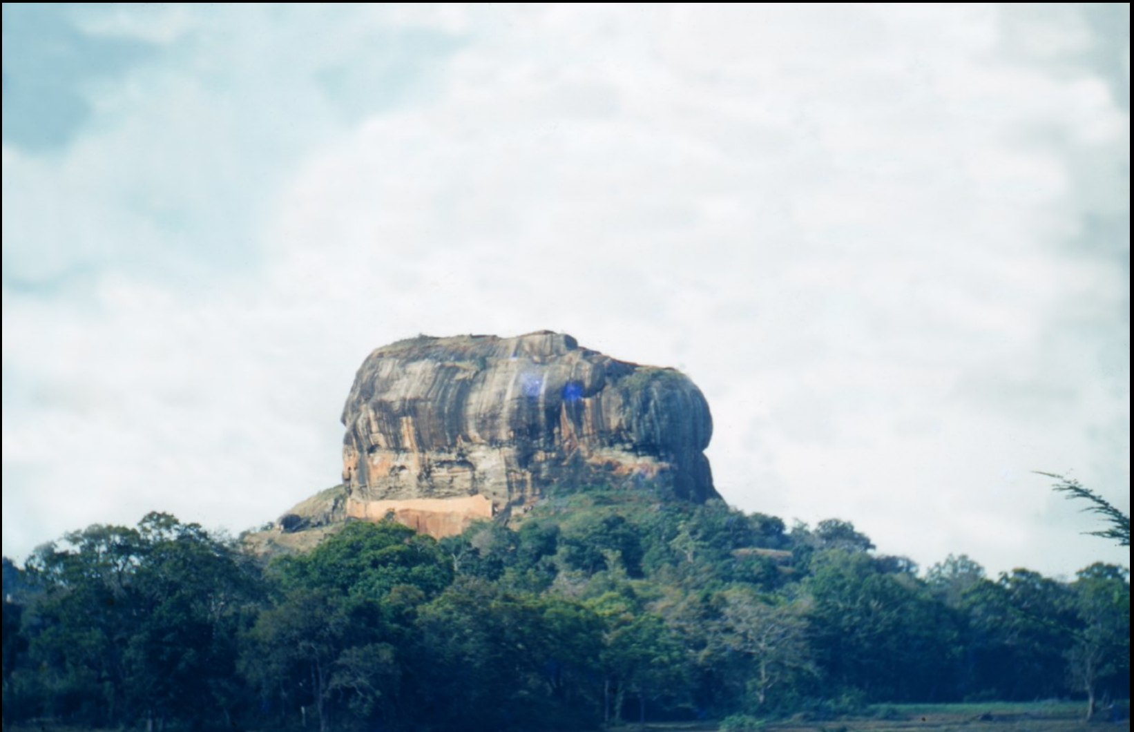
Sigiriya, Ceylon, Sri Lanka