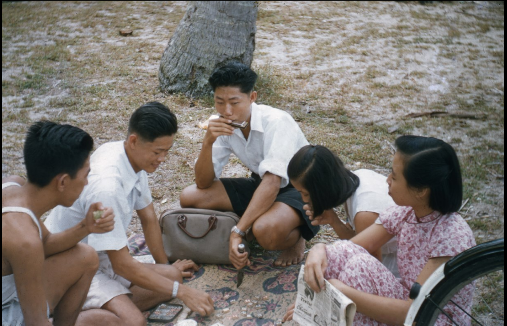
Students social gathering