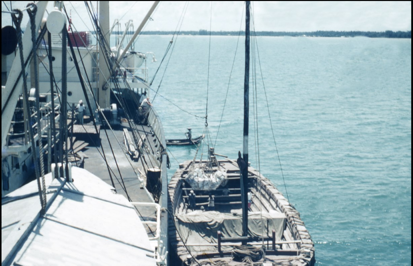
Fernhill, Norwegian merchant ship