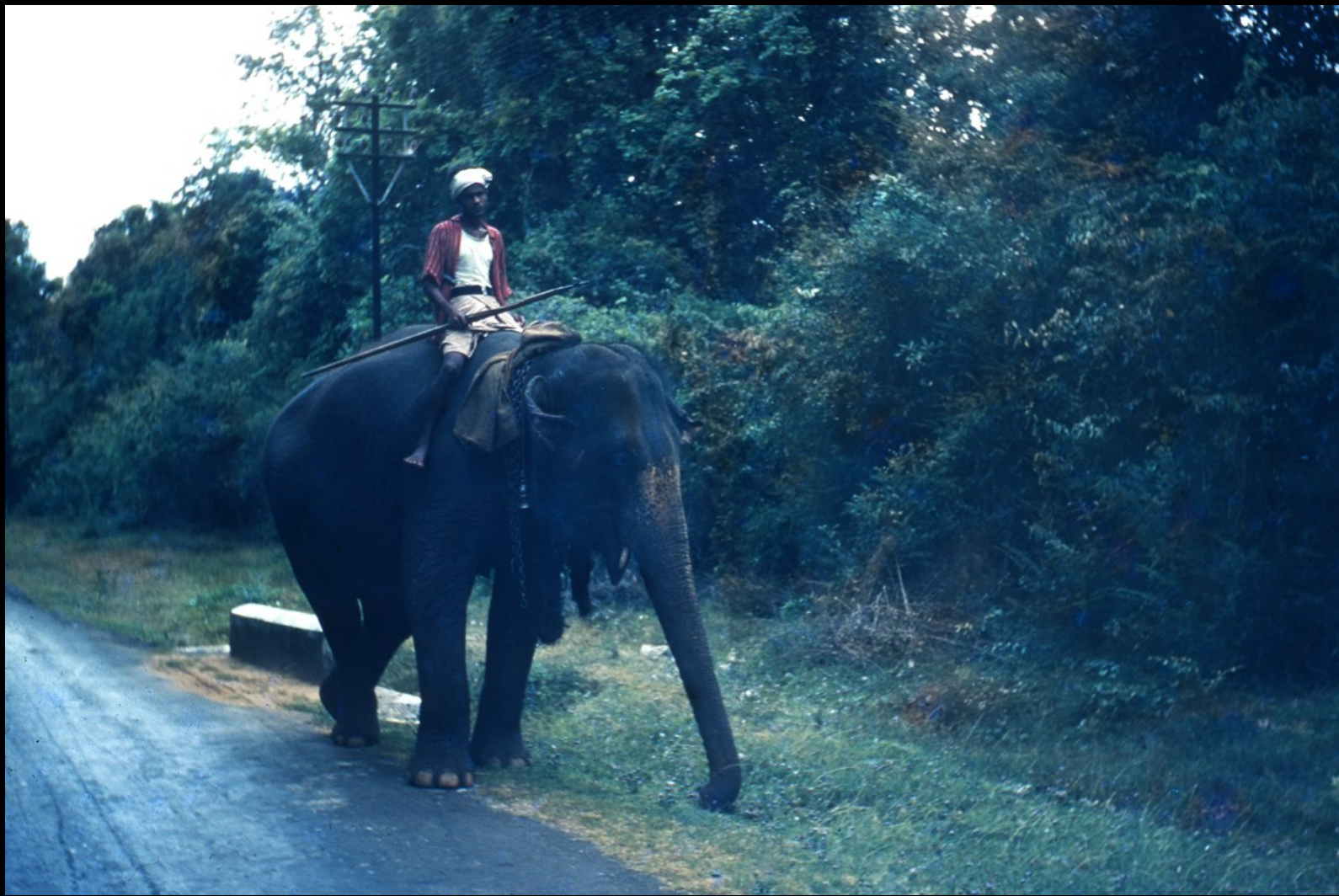
Elephant rider in Ceylon, Sri Lanka