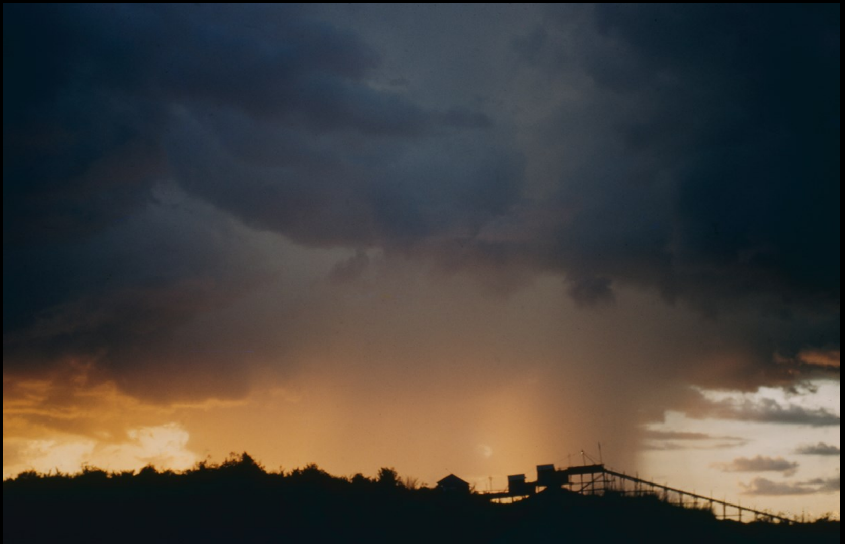
Sunset on a tin dredge