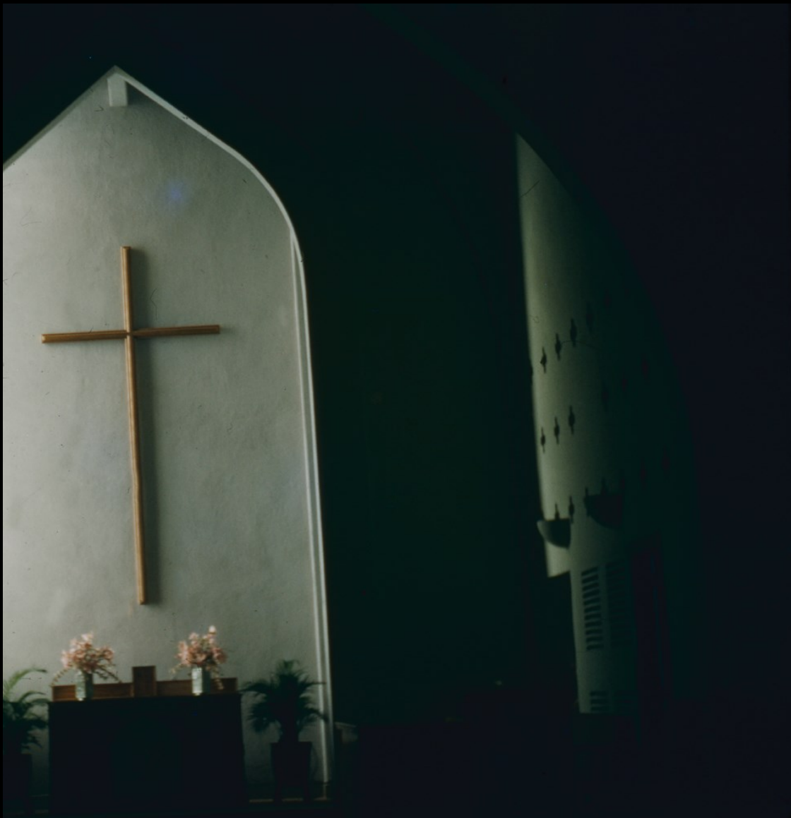
Sanctuary view of the Sitiawan Wesleyan Church