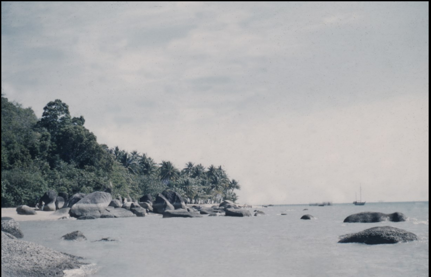
West coast of Malaysia