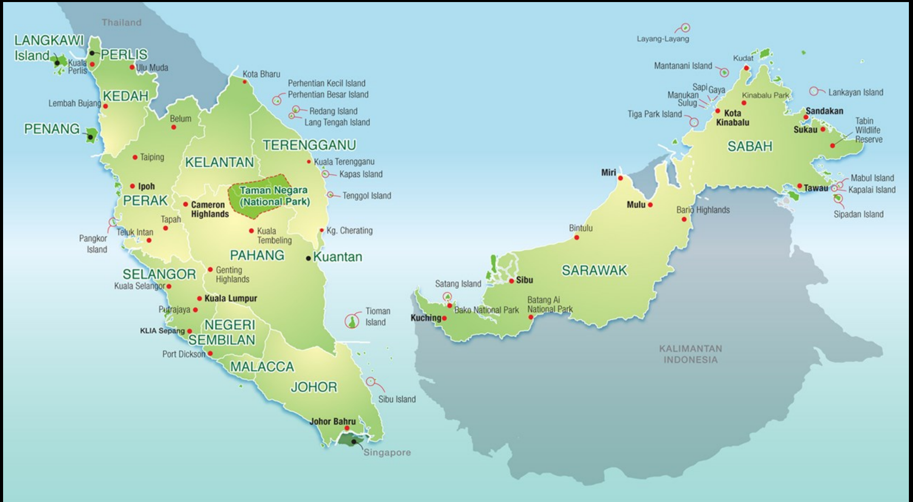
Map of Malaysia