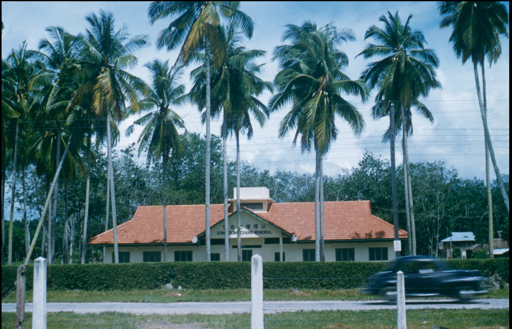
A memorial hall in the Anglo Chinese School, with library on one end and science lab on the other