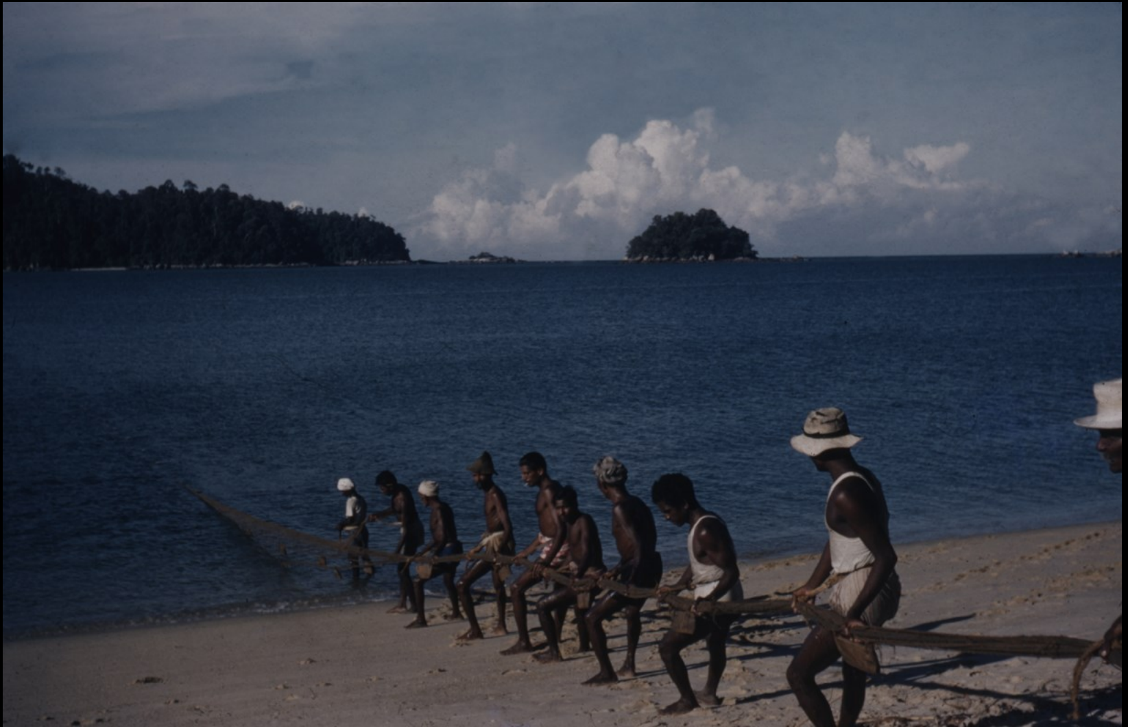
Indian fishermen pulling a long fishing net