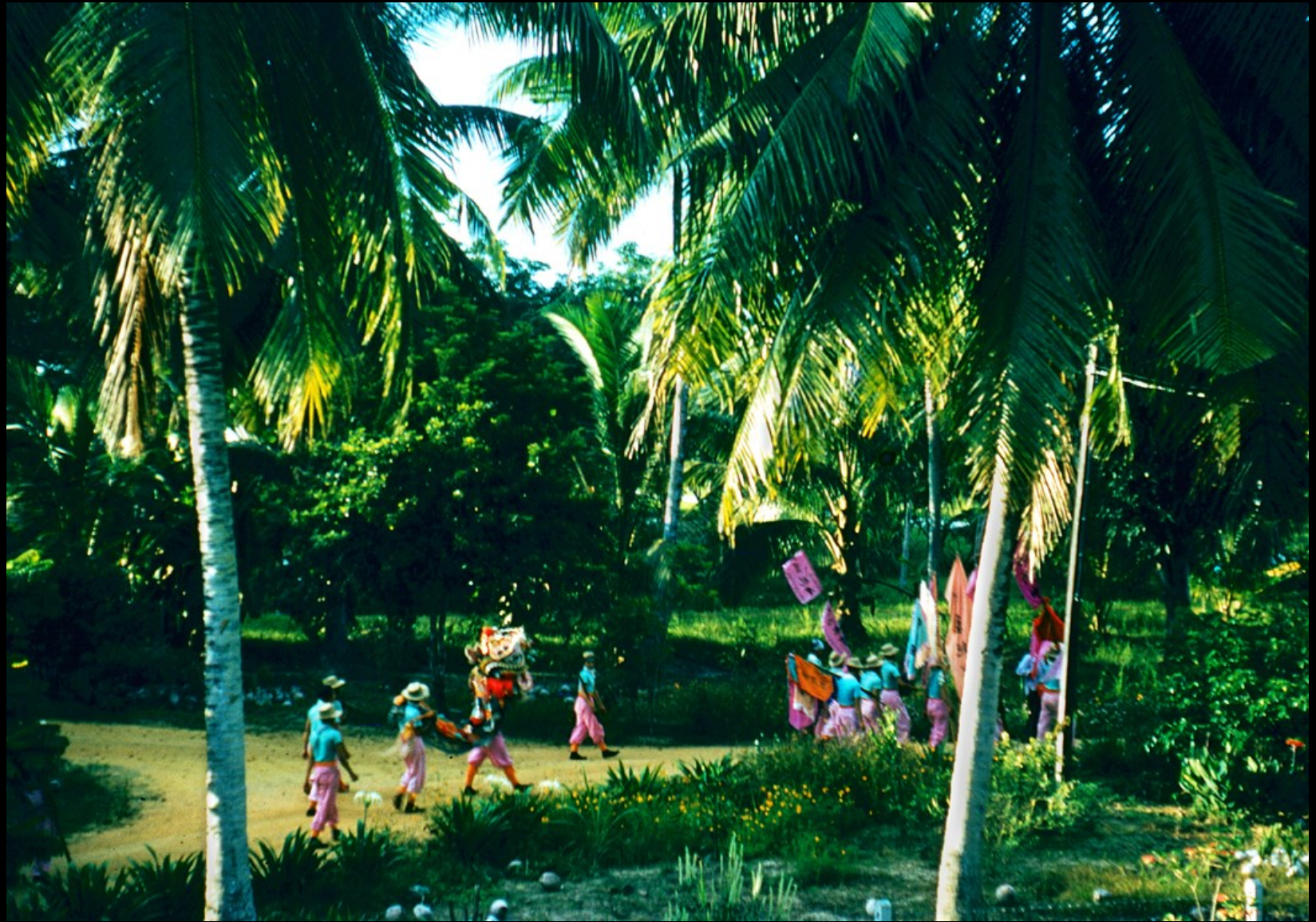
Lion dance parade next to the Anglo Chinese school