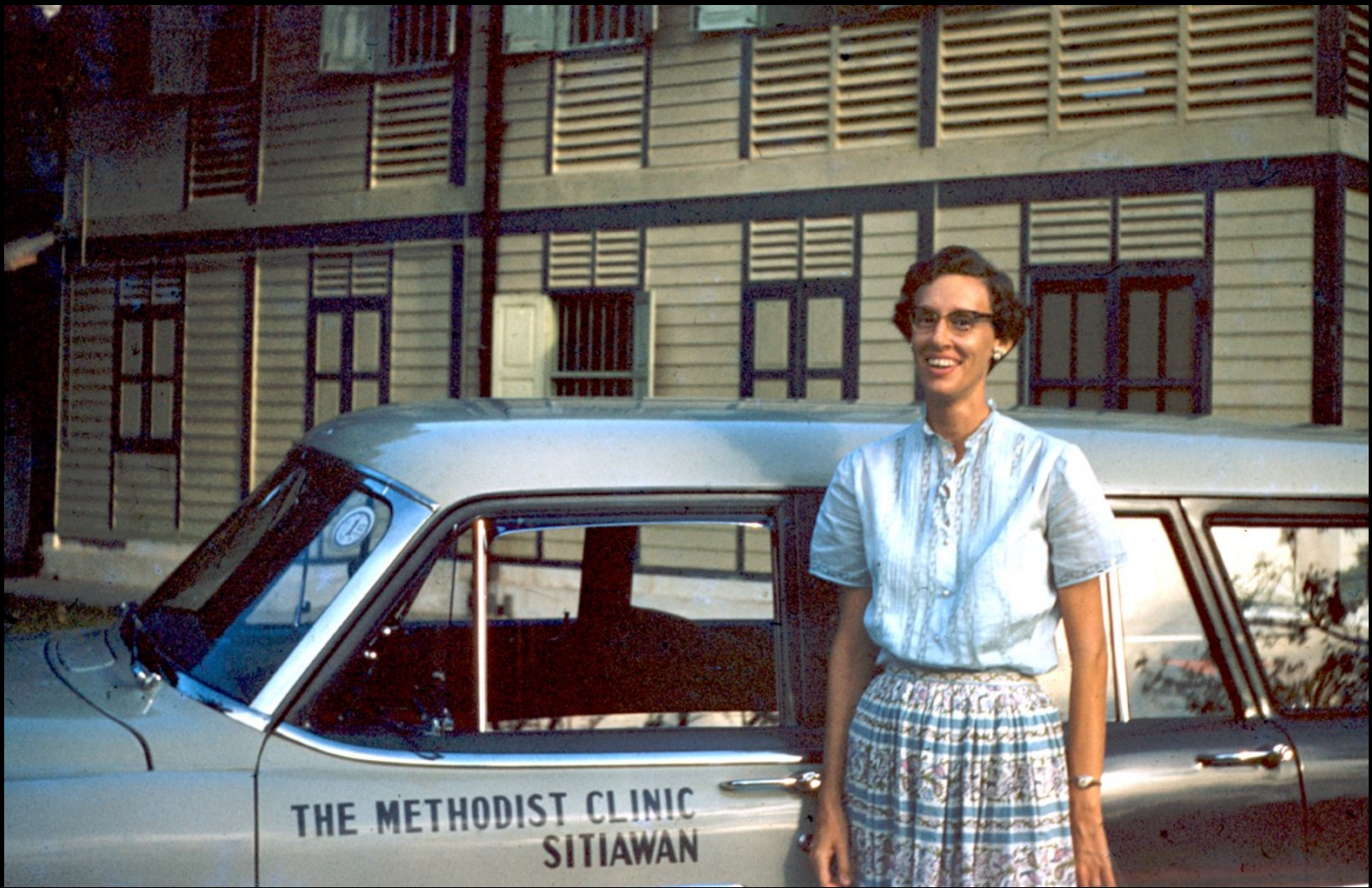
Station wagon used by the doctor and nurse to provide health care to people in rural Sitiawan