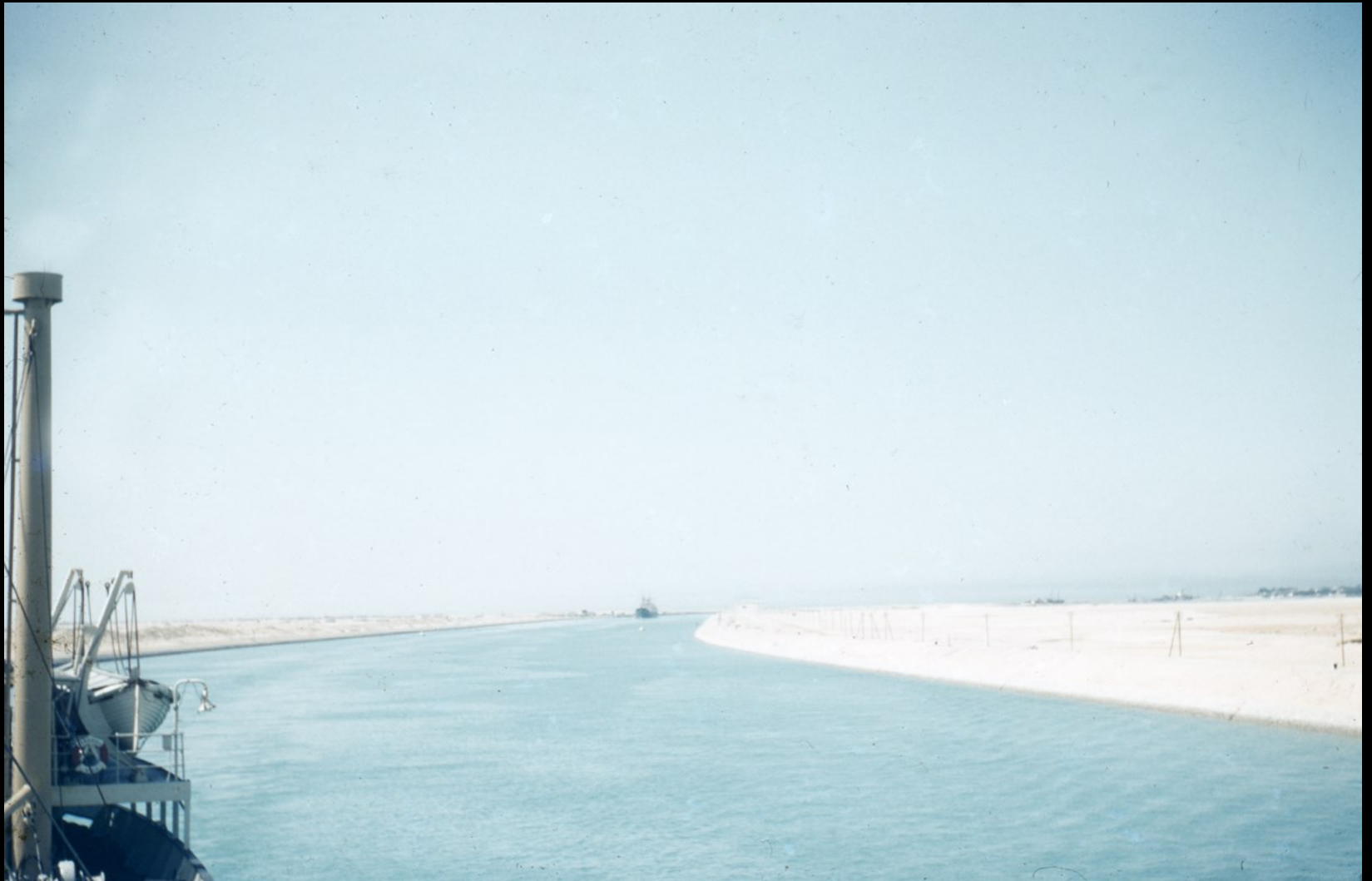
Along Suez Canal