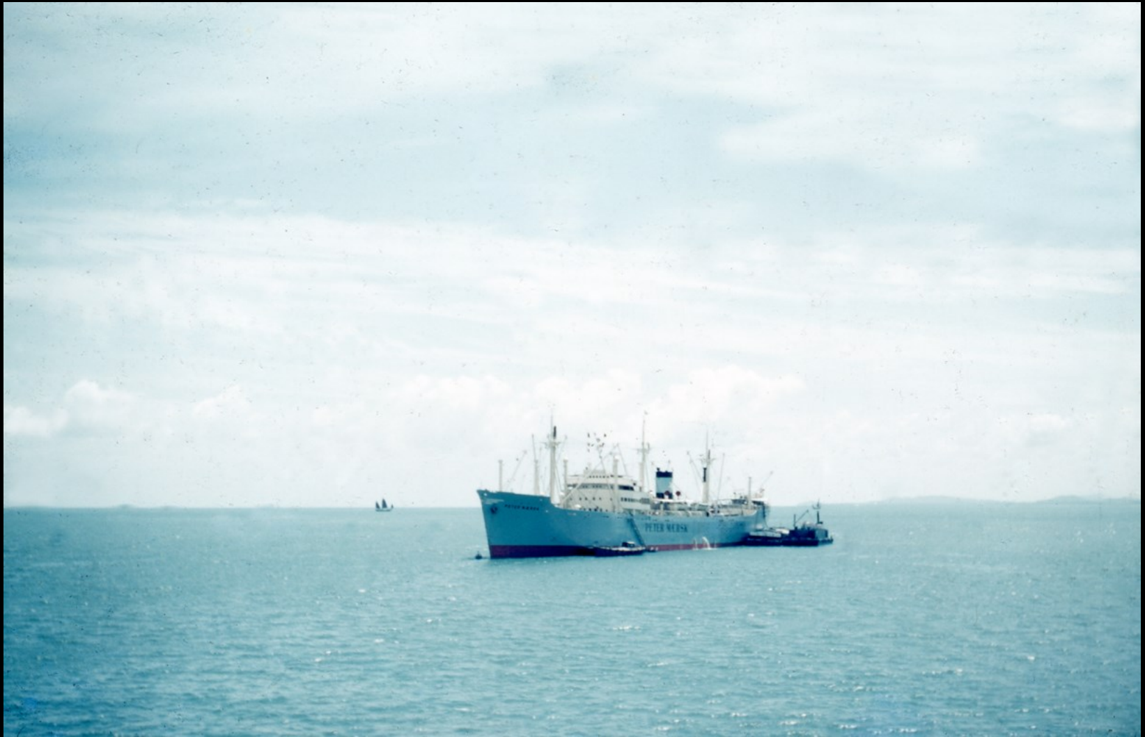
Danish ship in the Indian Ocean