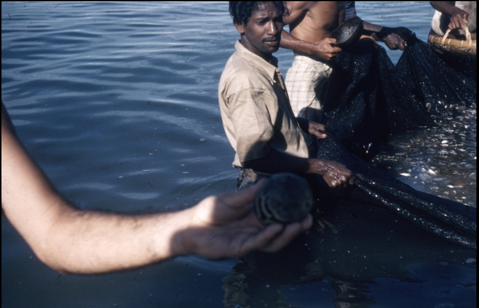
Indian fisherman caught a sea urchin