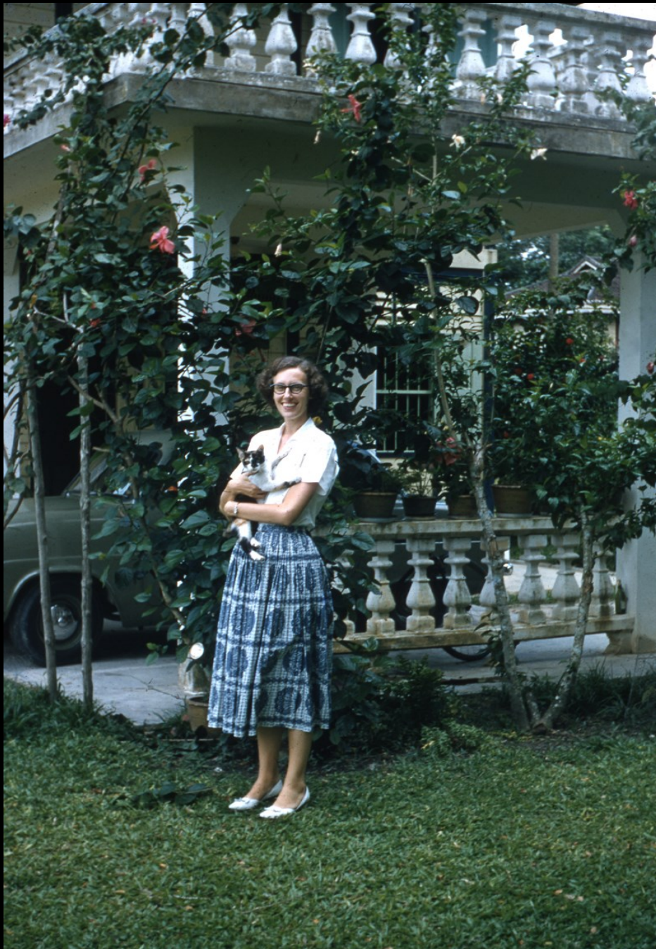
Holding a cat in front of the mission bungalow