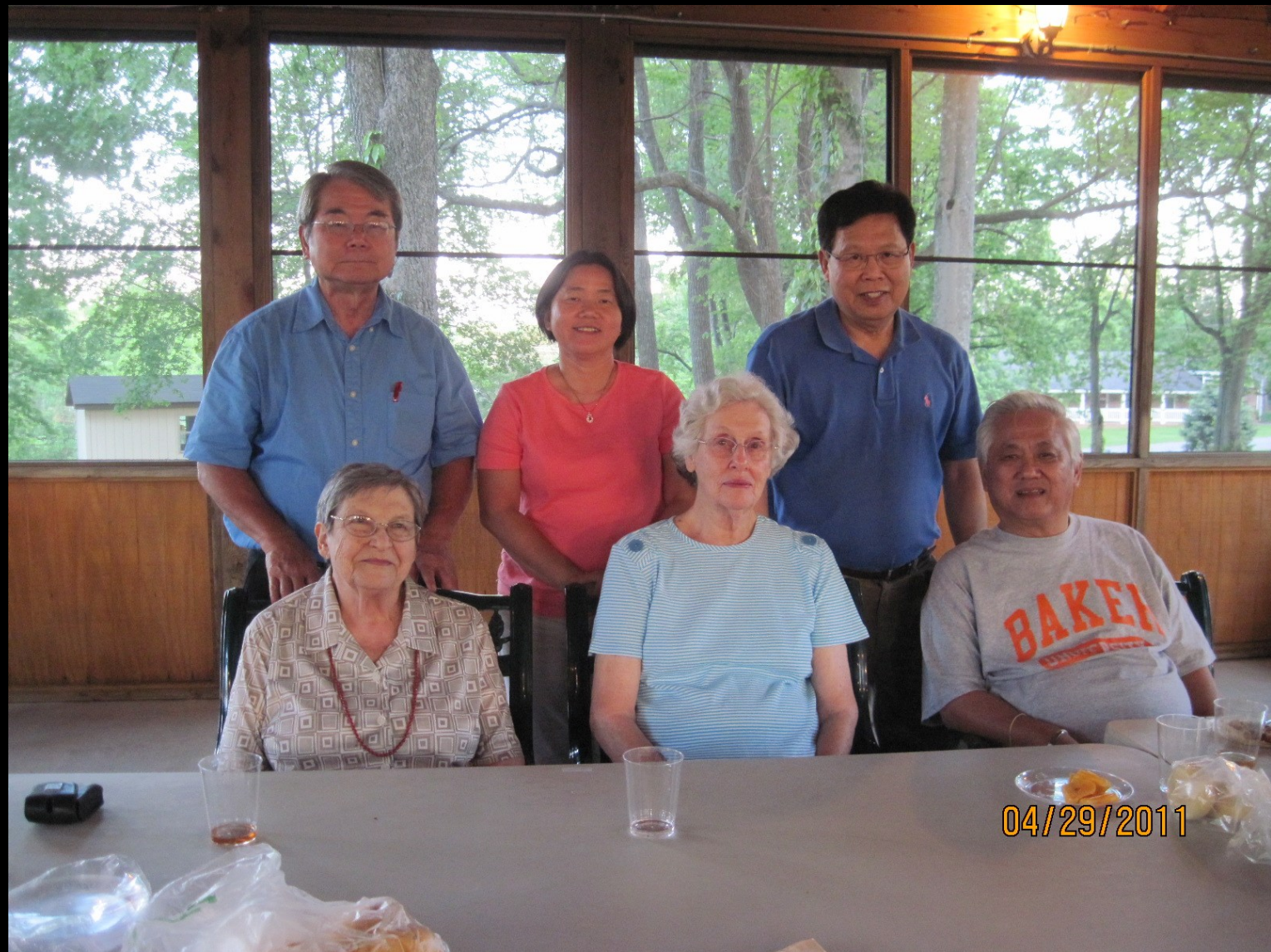
Students and friend visiting Dot at McKendree Village