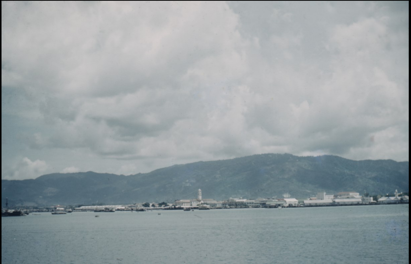
Approaching Penang, Malaysia