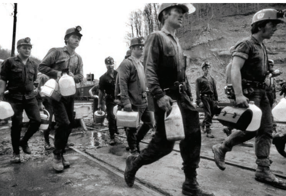
Coal miners in Wise, Va., head into the elevator at shift change. Each carries a federally mandated water jug and a lunch pail.

the life of the Vanderbilt library as they once enriched the newspapers in which they were published.”