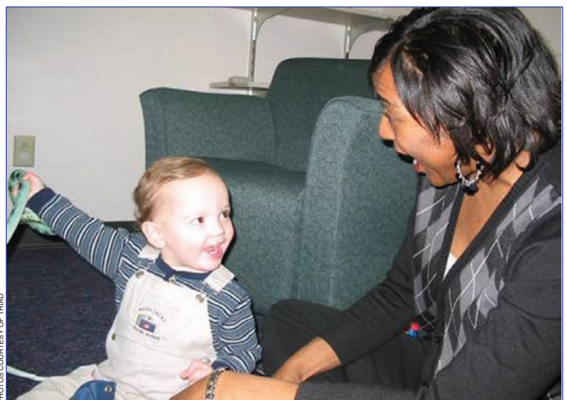
The Screening Tool for Autism in Two-Year Olds involves interactive, play-based activities.

Stone is using the STAT in studies that examine the early development of social orienting in younger siblings of children with autism spectrum disorders before the age of 2. For more information on these studies, link to “autism” on kc.vanderbilt.edu/studyfinder , the Vanderbilt Kennedy Center’s web-based list of ongoing research studies involving children or adults, with or without disabilities.