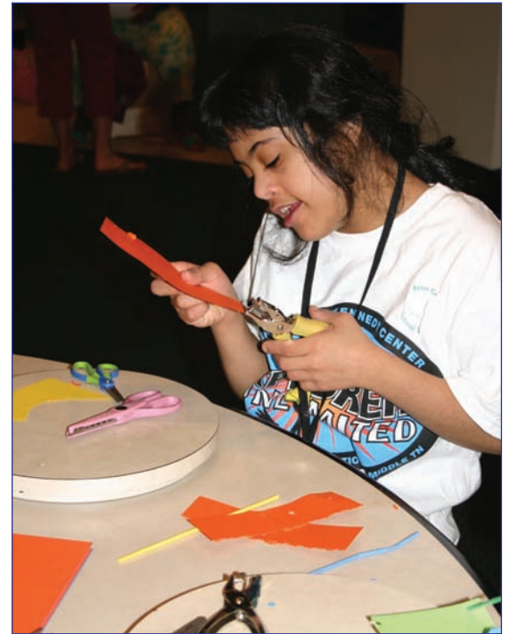
Explorers Academic Camp for youth with Down syndrome incorporates research.