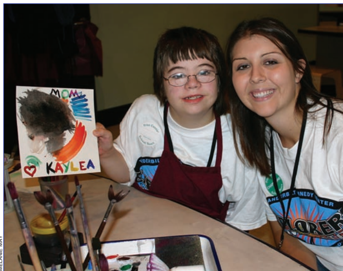
Explorers Unlimited Academic Camp not only served youth but also provided an opportunity to study health outcomes in parenting.

Unexpectedly as well, 79% of patients with psychosis were women. In this sample, psychosis and severe psychopathologies were just as common