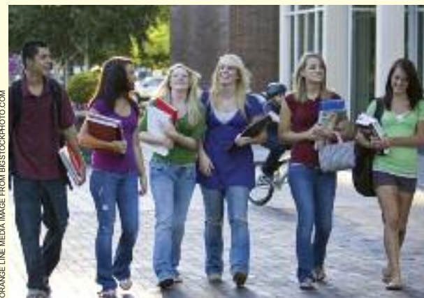
ORANGE LINE MEDIA IMAGE FROM BIGSTOCKPHOTO.COM