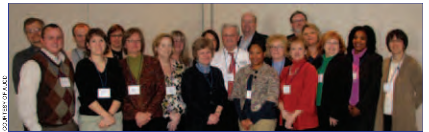
Tennessee Act Early Team members at Region 4a Act Early Summit