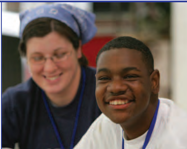
Camp Shriver Transitions and Sports 2008