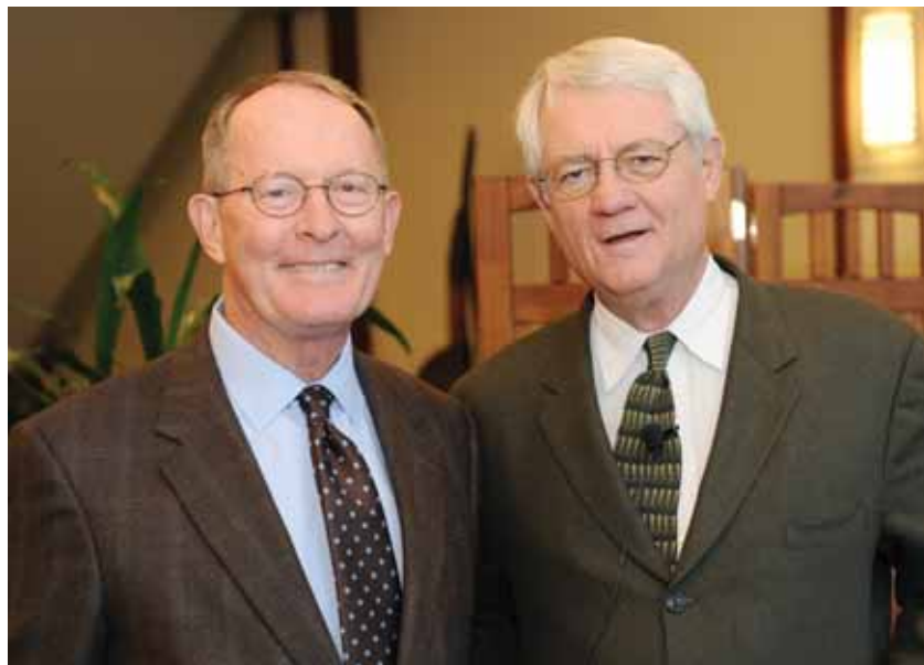
Left: Senator Lamar Alexander, B.A., VU’62. Right: 2008 Howard lecture Roy Blount Jr., B.A., VU’63, following Blount’s talk on October 30, 2008.