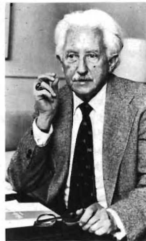
Erik H. Erikson (b. 1902), German-born American psychologist who conceptualized the eight stages of psychosocial development.

Erikson is more reluctant, given the era in which he wrote, to discuss the domain of "ultimate concern." Nonetheless, albeit in a more limited way, he affirms the necessity of generativity when facing "the great Nothingness": "If there is any responsibility in the cycle of life it must be that one generation owes to the next that strength by which it can come to face ultimate concerns in its own way" (1964:133). Shneidman directly and Kübler-Ross indirectly refer to his idea of generativity. Yet their extrapolations of this concept, although they argue in opposite directions, betray their ethical biases and miss the point of Erikson's definition. Kübler-Ross implies that persons who care about others will experience greater personal "ease in accepting death." Shneidman argues on the other hand that talking about "ego-integrity or generativity" does "not mollify the terror of death . . . even though one can be grateful to Erik Erikson for the almost persuasive way in which he has