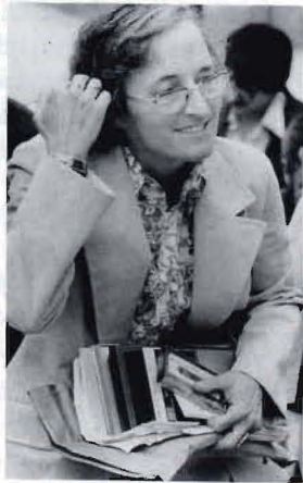
Psychiatrist Elisabeth Kübler-Ross, a pioneer in the death and dying movement.

“Culture of joy” psychologies consider life, or death in this case, as an ordinary fact of nature to be accepted, an occasion for the unfolding of innate individual potentialities and growth.