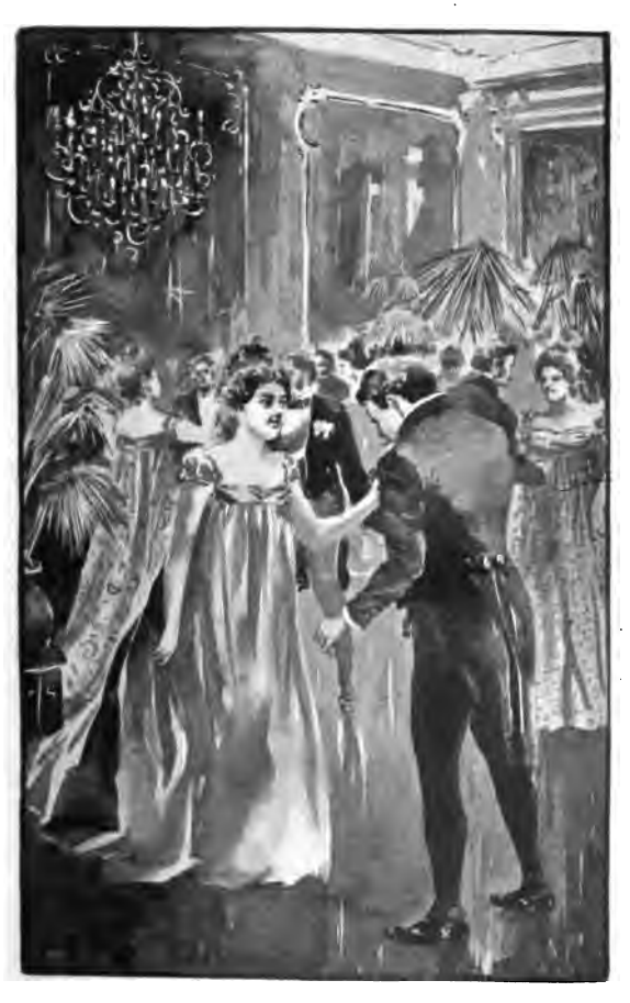
"There was a sound of revelry by night."—Page 135. Childe Harold's Pilgrimage.