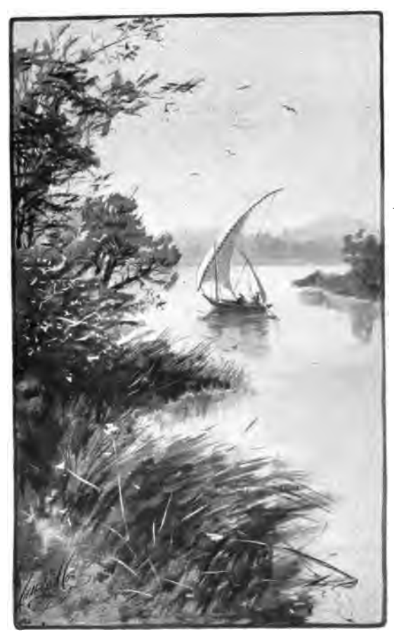
"My bark did skim the bright blue waters."—Page 217. Childe Harold's Pilgrimage. Digitized by GOOG