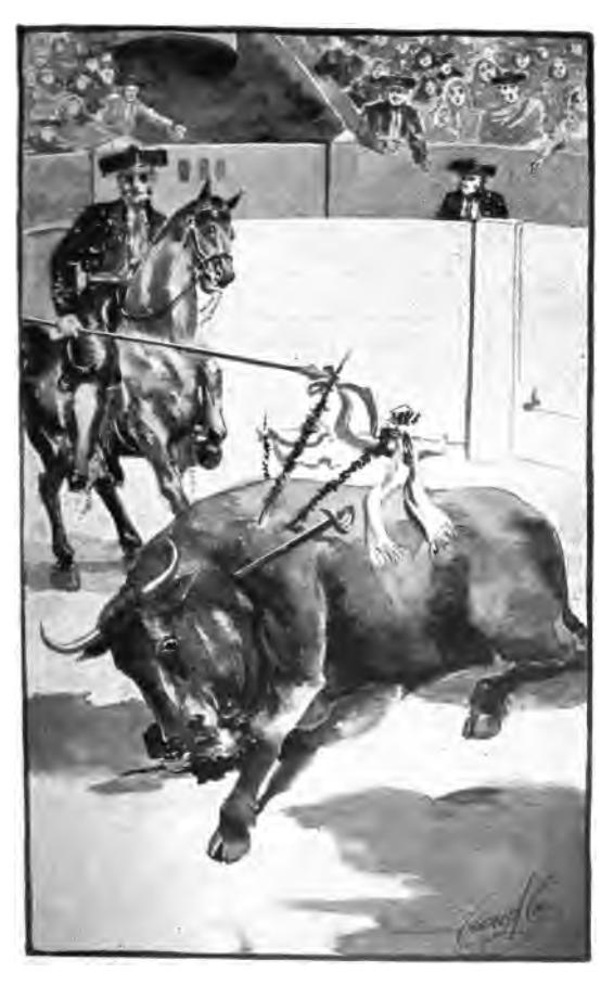
' Slowly he falls, amidst triumphant cries."--Page 59. Childe Harold's Pilgrimage. Dipliced by Google