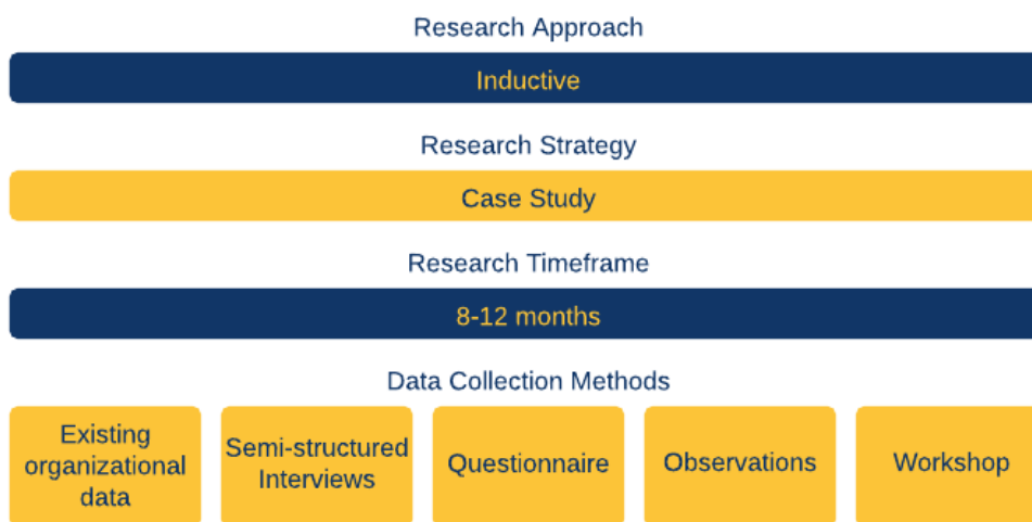
Figure 3 Research Strategy

This study originally intended to utilize five data collection methods: