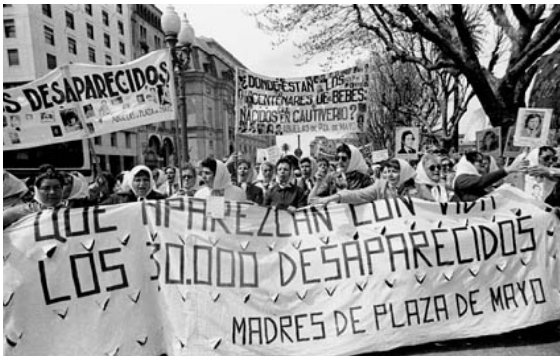
Figure 3 The Madres during a Resistance March in December 1982

Just ten weeks after it began, the Falklands War came to an end on June 14, 1982. Argentine military forces had been quickly and effectively dealt with and the Argentines knew they could not come back from their losses. For the military junta, the loss was humiliating and represented a deathly blow to their credibility. 156 Knowing they would be unable to recover from the consequences of the war, General Leopoldo Galtieri quickly turned over power to General Reynaldo Bignone before the country announced it would be holding public elections and transitioning to a democracy.