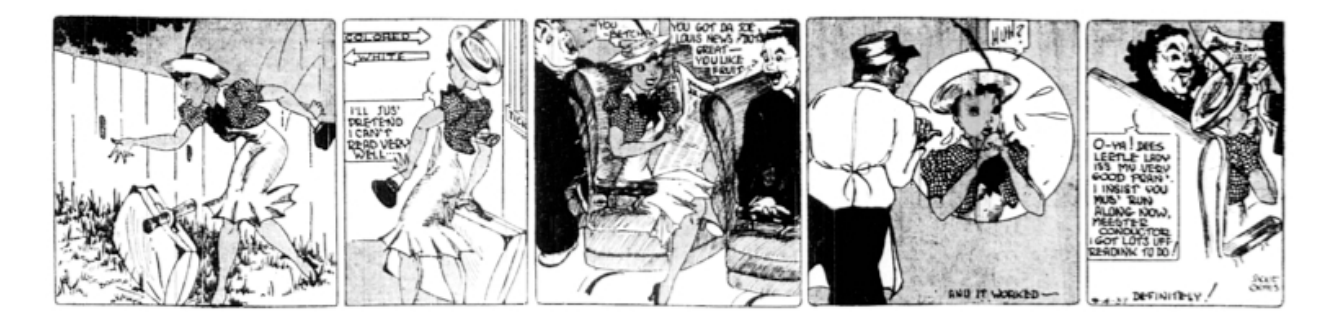
Figure 5. Torchy challenges segregation by pretending she "can't read very well."

White section and starts reading a newspaper. An Italian man sitting beside her notices that she's catching up on the latest news about the black boxer Joe Louis, and the two bond over the article. When the conductor passes by and nearly evicts Torchy from the train car, the Italian man vouches for her, saying, "Dees little lady iss my very good fran'. I insist you mus' run along now, meester conductor, I got lots of readink to do!" (Figure 5) Obviously, what Torchy has done is extremely bold for an African American, let alone a black woman, to attempt in the 1930s.