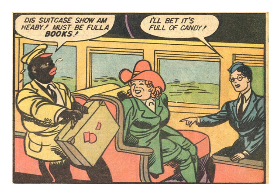
Figure 1. An example of a stereotypical black train porter in a 1940s Wonder Woman comic.

By constructing black identity in this manner, comics worked to exclude black readers from the idea of national stakeholdership. Furthermore, this act of exclusion elevated white readers by making whiteness what blackness was not. Blackness became a measuring stick for the white national identity. Whiteness signified content, while blackness signified lack, either through the visual stereotyping of black characters or through their complete absence from the comics pages. Thus, comics became an extension of legal and cultural discriminatory practices.