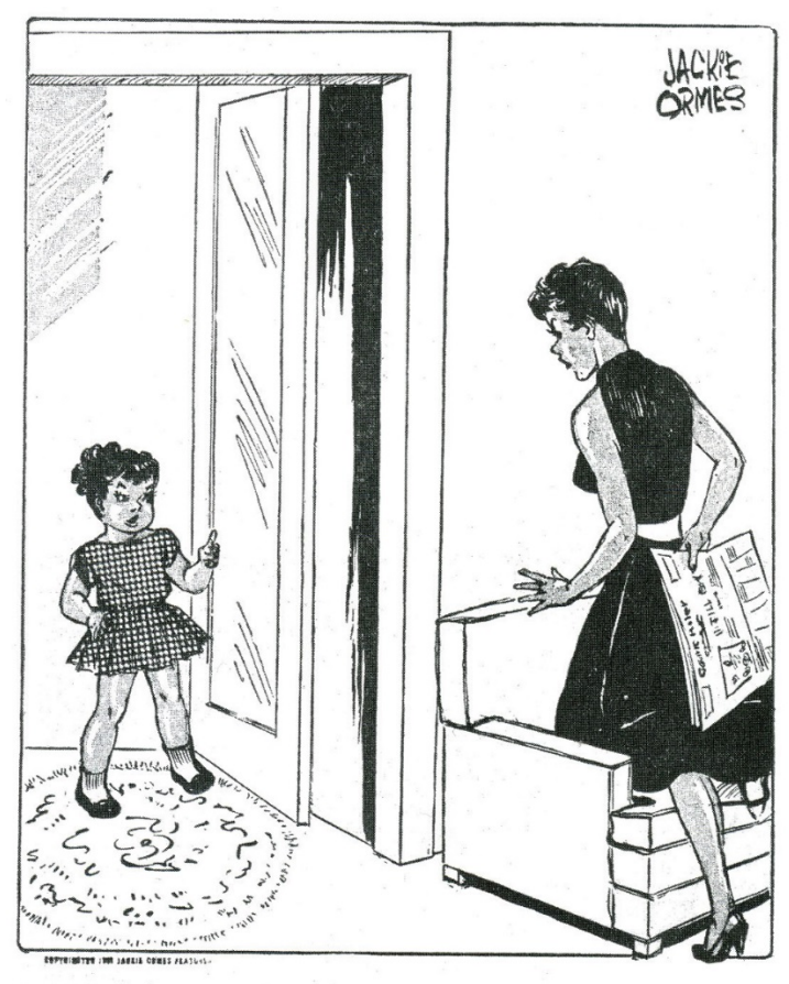
"I don't want to seem touchy on the subject . . . but, that new little white tea-kettle just whistled at me!"

unique idiom for Patty-Jo that combines elevated concepts with childish understanding (Goldstein 85). For example, Figure 6 illustrates a panel dated October 8, 1955, in which Patty-Jo, having just heard about the murder of Emmett Till, tells Ginger, "I don't want to seem touchy on the subject... but, that new little white tea-kettle just whistled at me!" (Goldstein 128). The "whistling" refers to the fact that Till was murdered for whistling at a white woman.