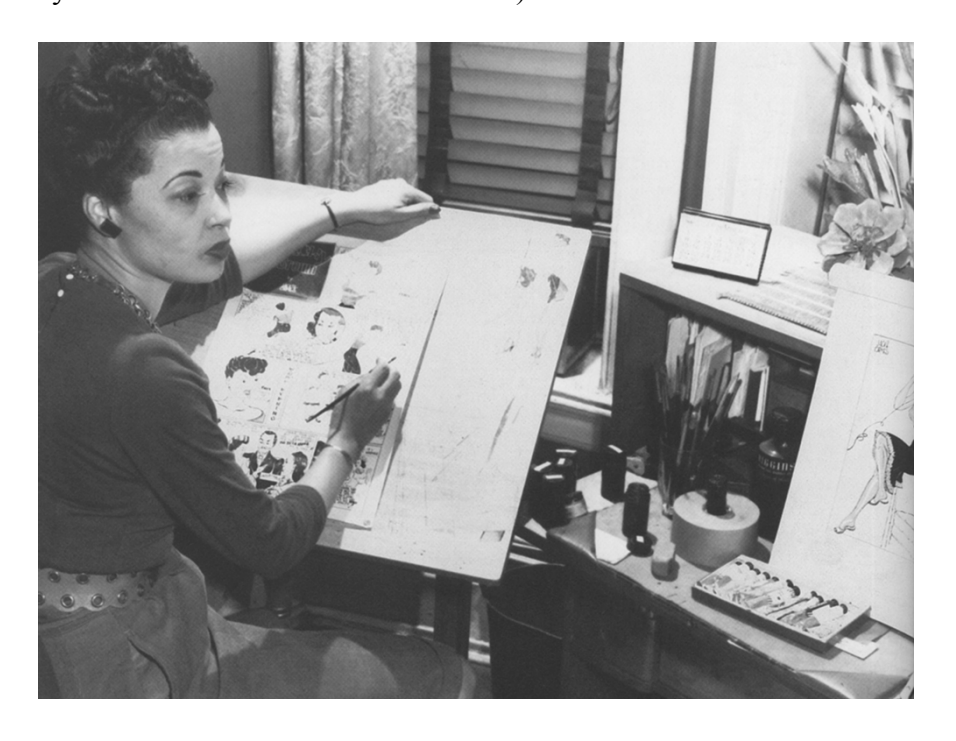
Figure 4. Jackie Ormes at work.

citizen at a time when black women were virtually nonexistent in mainstream comics (except for stereotypical portrayals of them as maids and mammies).