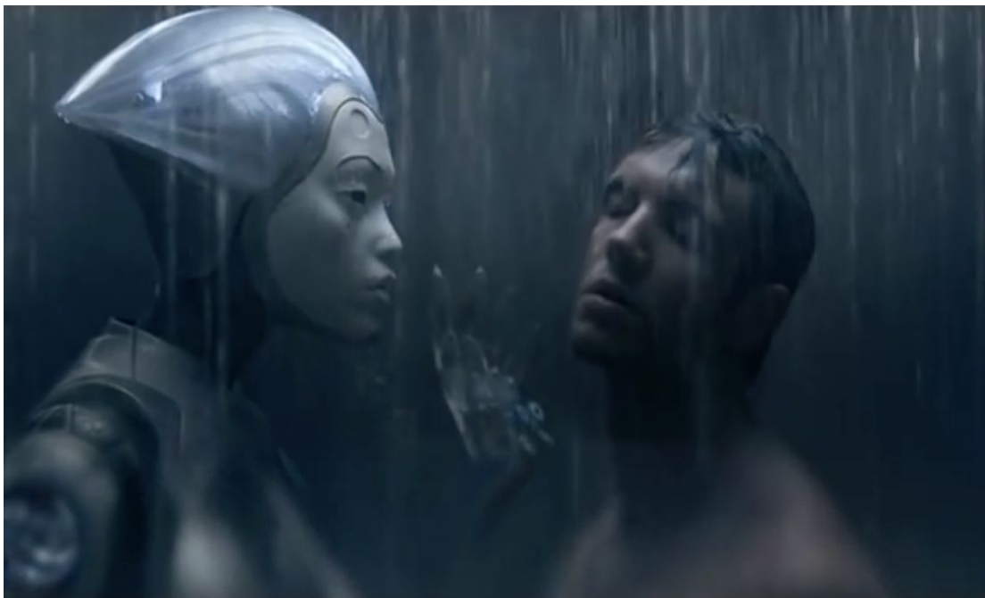
A still from Phillips’ “Robot Skin” campaign

bot stars in what has come to be known as the “Robot Skin” commercial, a two-minute short film that documents the morning routine of this fembot. She emerges, insect-like, from a high-tech cocoon, and turns on a luxurious rain-shower. A nude white man, seemingly unaware of her presence, steps into the shower and begins to wash. The fembot inserts a Phillips electric razor into her wrist, which rearranges itself to easily accommodate the device, and raises her new limb to the man’s face. She gives him a close shave; she stands with her face centimeters away from his, and the two sensually sway under the shower head. Suddenly the man opens his eyes, as though seeing this gynoid for the first time. He smirks, the music abruptly pauses, and she turns away, seemingly ashamed, as the man walks away, turning back and smiling when he realizes how smooth is just-shaved face feels. It’s an arresting moment for consumers: it’s as though she has become too involved in her own sexuality, too eager to participate, and so the interaction must halt, lest the instrument acquire a sense of participation.