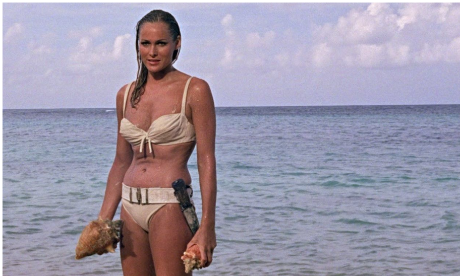
Andress, her bikini, and her knife in Dr. No

The toxic conflation of sensuality and violence in female A.I.s reached new depths by the 1960s, when Vincent Price and Frankie Avalon starred in Dr. Goldfoot and the Bikini Machine (1965, dir. Norman Taurog). Building upon the precedent established by femme fatales in noir film and exaggerated by the social fervor ignited by Ursula Andress' appearance in the now-iconic white bikini in the first James Bond film, Dr. No (1962, dir. Terence Young).