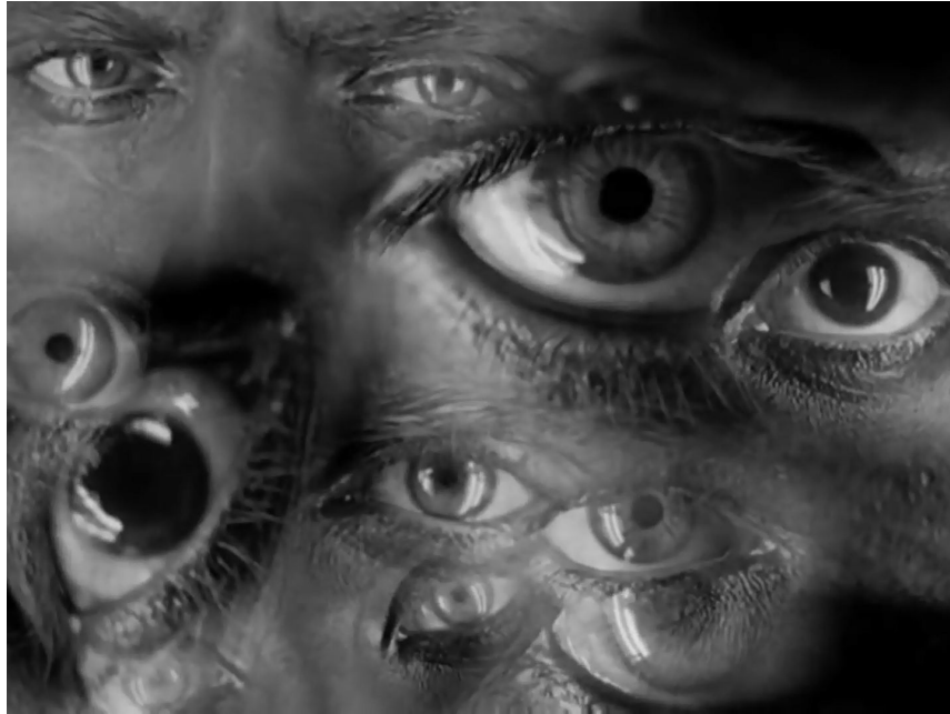
still from Lang's 1927 film, Metropolis

clutches violently at his own face, another's eyebrows twitch up and down, until finally a collage of disembodied eyes fills the frame.