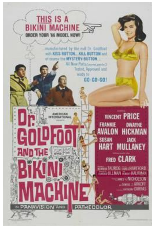
Poster for 1965's Dr. Goldfoot and the Bikini Machine

Andress-mania notched an inevitable apex with a series of teen-beach-movie send-ups, in which bikini-clad androids are used as hired guns.