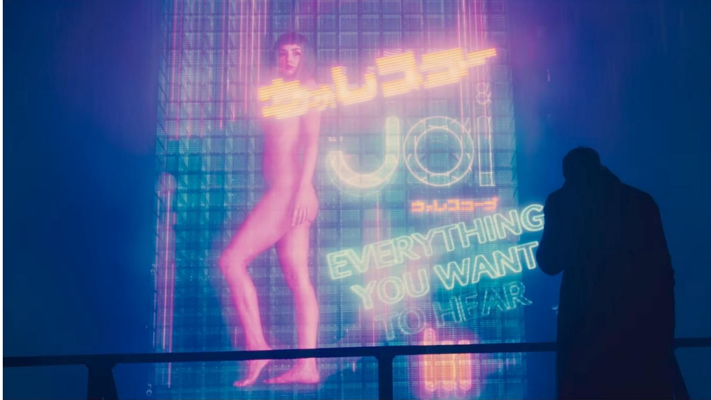
A still from Denis Villeneuve's Blade Runner: 2049, featuring Ana de Armas (in hologram) and Ryan Gosling (in silhouette)

At first blush, female characters seem to fare better in 2049 : Robin Wright's Lt. Joshi holds a position of power as an LAPD official, and the memory maker (Carla Juri as Dr. Ana Stelline) occupies prime real estate in Deckard and K's plots. But Wright's Joshi makes sexual advances toward Gosling's K, and Stelline is forced to live in quarantine and is the product of Deckard raping Rachael in the first film. Even small narrative victories are undercut by painting these female characters only in relation to the film's male characters.