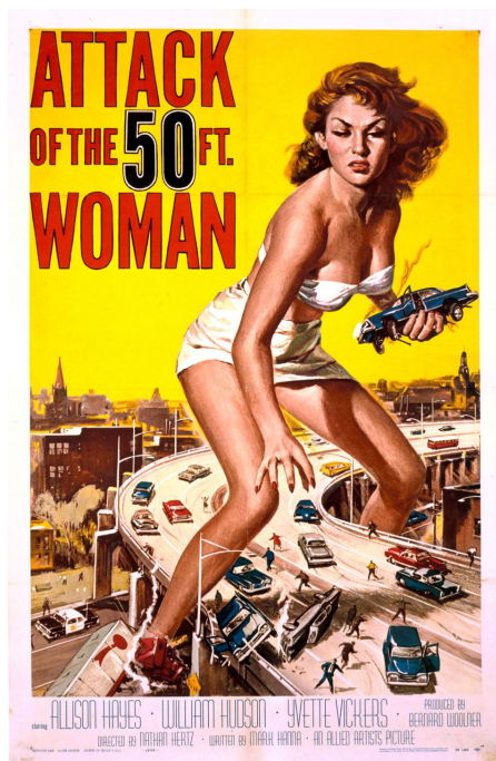
Poster for Attack of the 50 Foot Woman (1958, dir. Nathan Juran)

K's hero's journey falters when he discovers the extent to which Joi is a product accessible to other male consumers. When he encounters her gargantuan holographic billboard, he reacts as though he has suffered a physical blow. Thanks to the cinematographic wizardry conducted by master filmmaker Roger Deakins (the film's cinematographer, also known for Sicario [2015, dir. Villeneuve] and Skyfall [2012, dir. Sam Mendes]), the visual splendor of this sequence might bowl over the audience fully enough to distract viewers from Joi's nudity, and from her resemblance of a futuristic pin-up. The scene plays out like Mulvey's prose rendered in Technicolor. Gosling stands in silhouette for much of the sequence, dwarfed by Joi's towering image. The composition and lighting of these shots are gorgeous; but they are the male gaze incarnate.