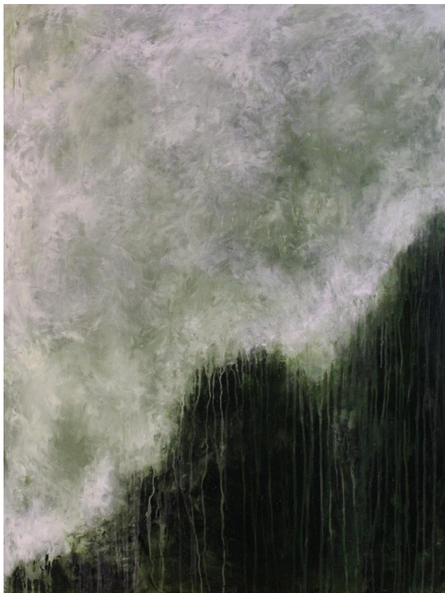
Peter Kline. Untitled. 36" x 48" acrylic on wood panel. 2015.