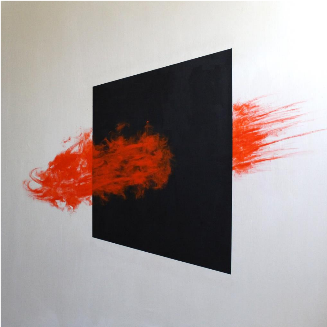
Peter Kline. Untitled. 44" x 44" acrylic and charcoal on bed sheet. 2015.