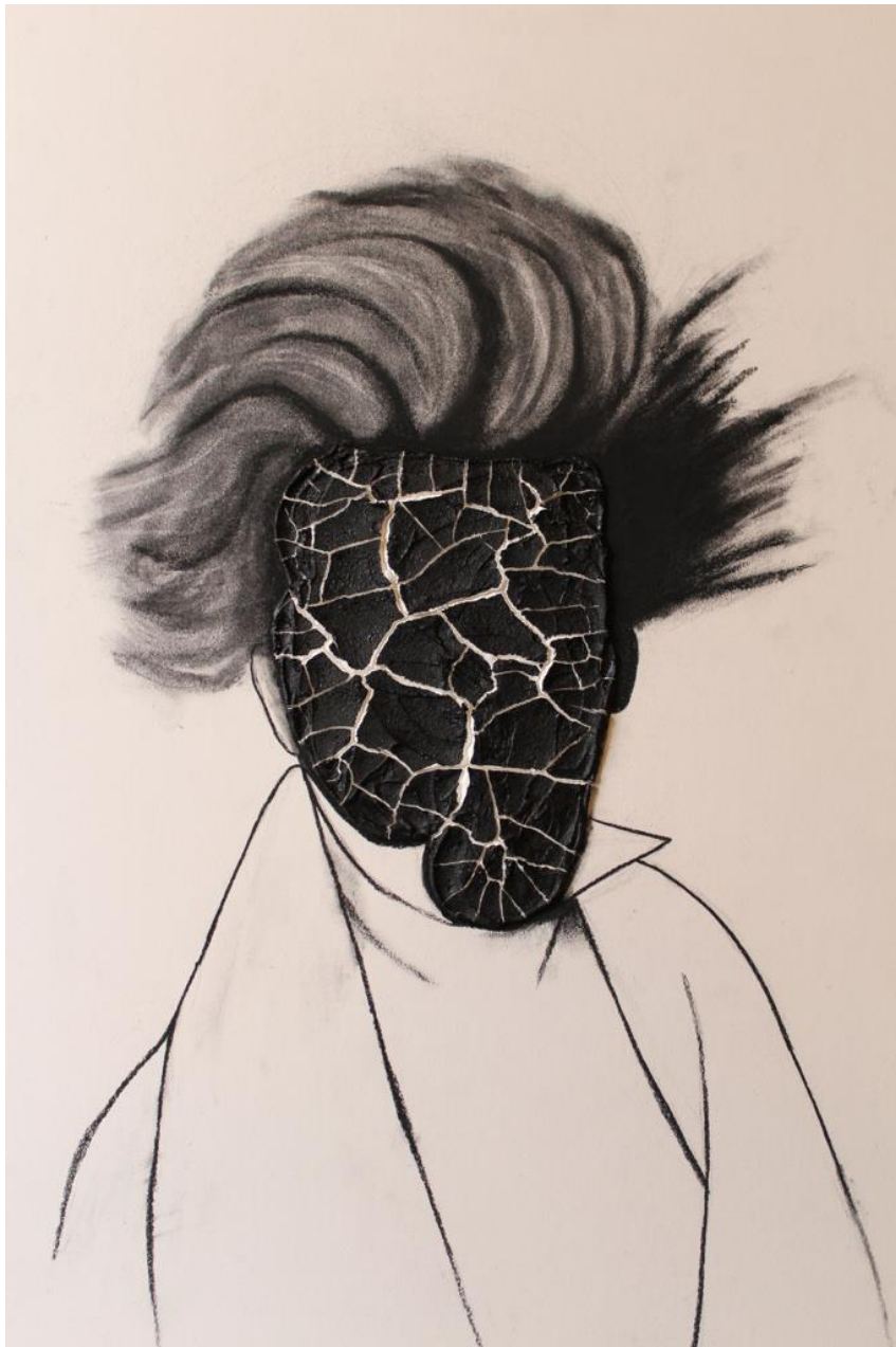
Peter Kline. Untitled. 15" x 20" acrylic and charcoal on illustration board. 2015.