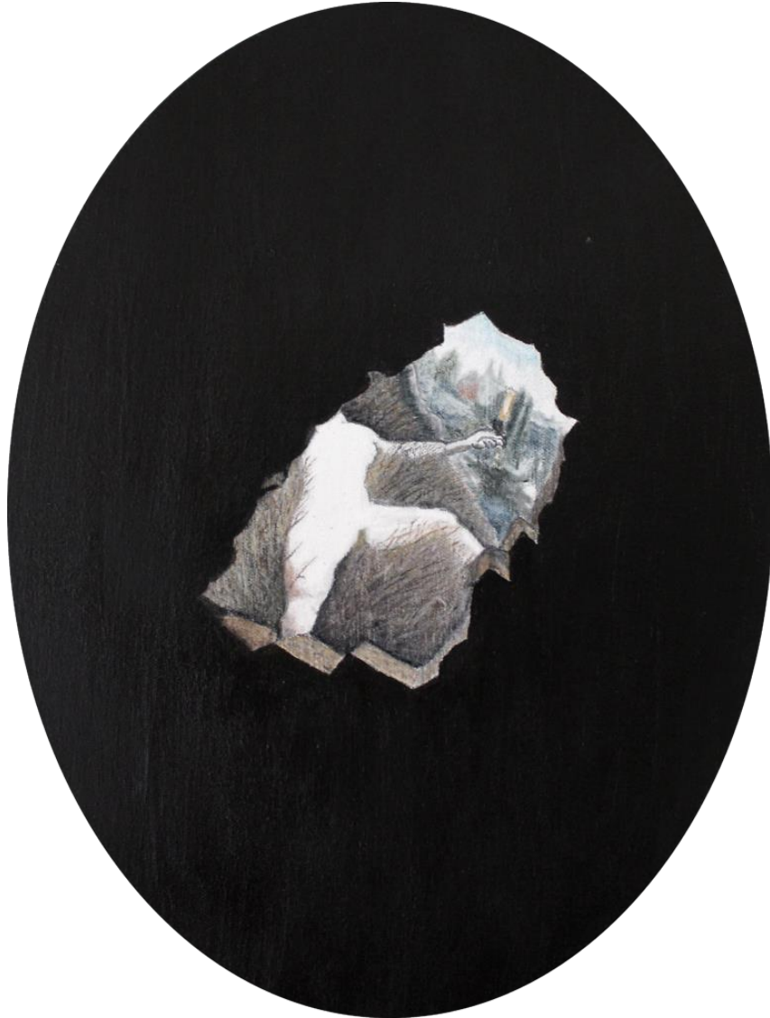
Peter Kline. Untitled. 12" x 16" acrylic and colored charcoal on canvas. 2014.