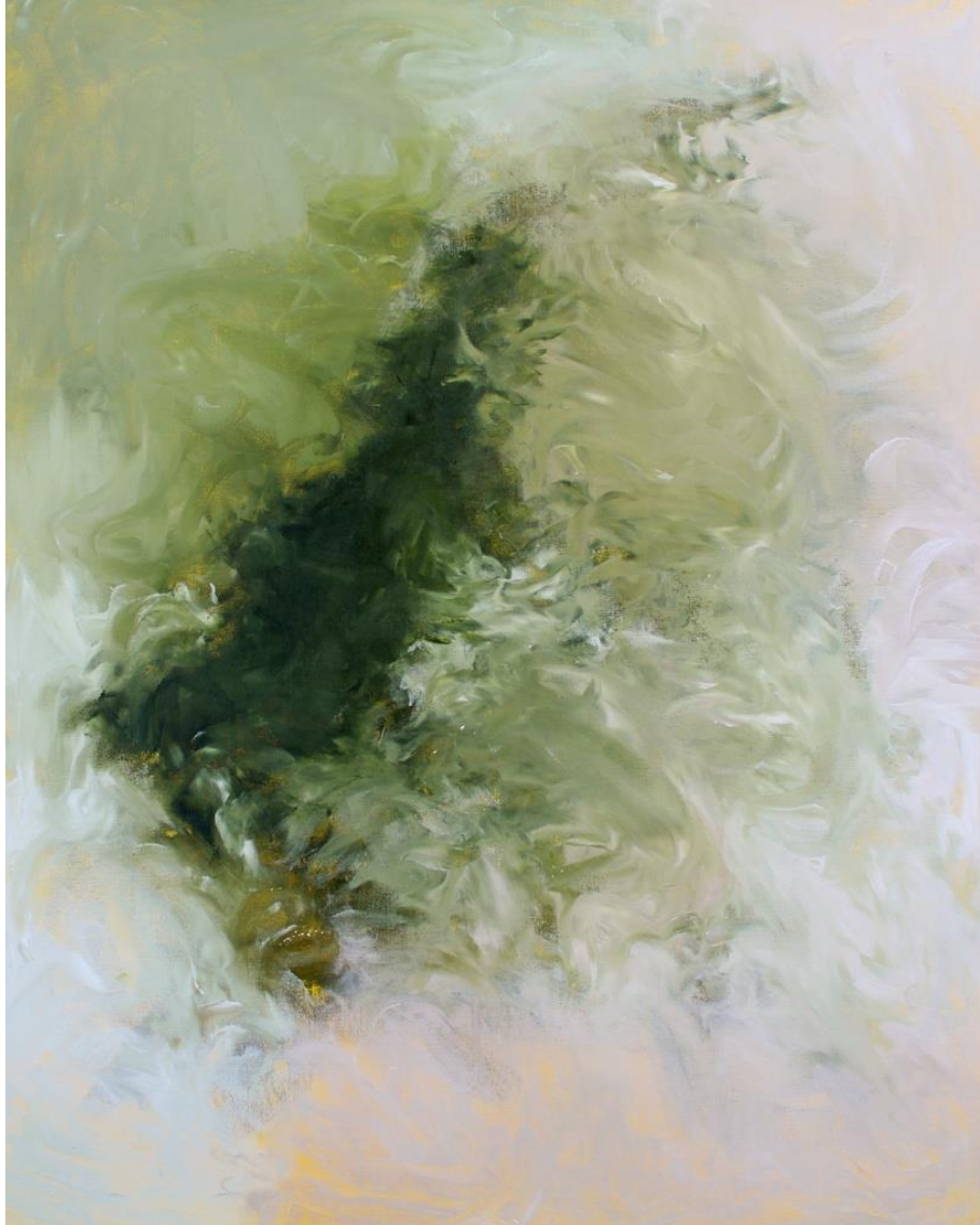
Peter Kline. Untitled. 24" x 36" acrylic on canvas. 2015.