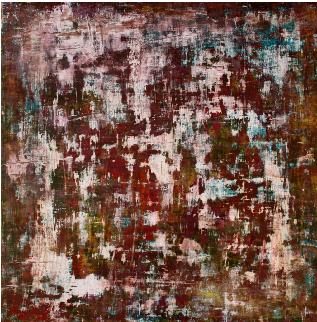
Peter Kline. Untitled. 24" x 24" acrylic on wood panel. 2015.