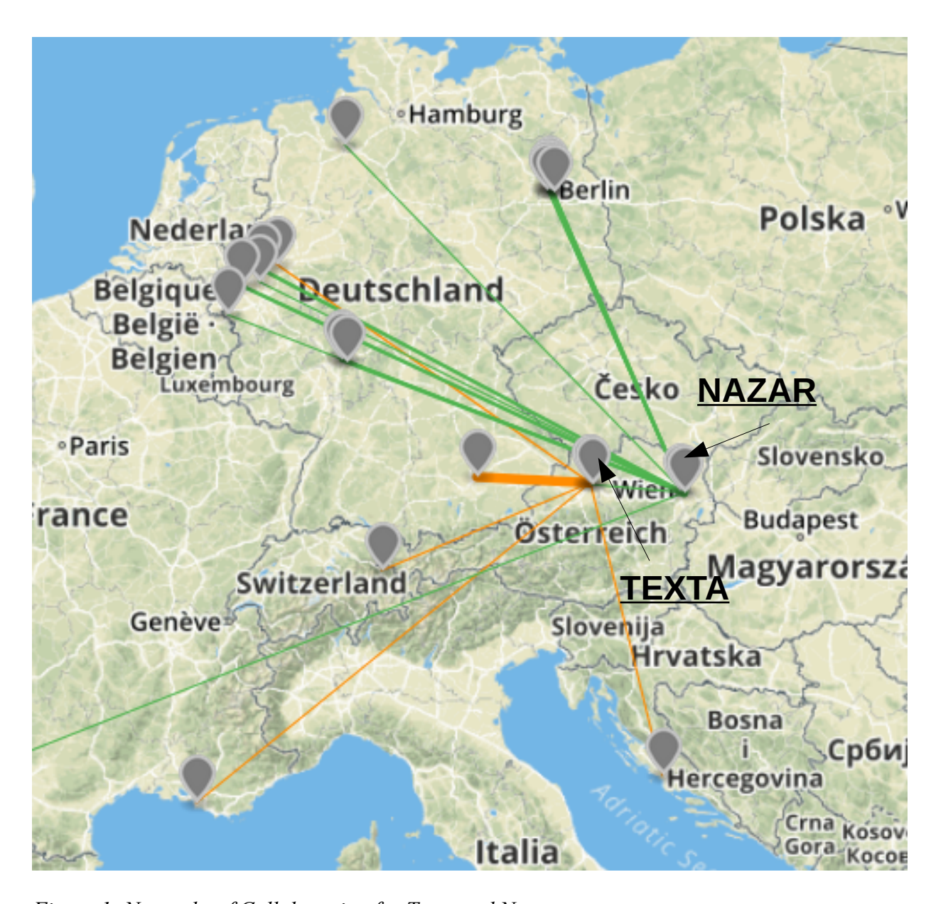
Figure 1: Networks of Collaboration for Texta and Nazar