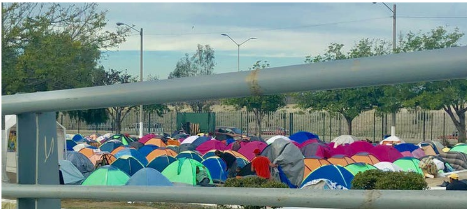
A refugee camp in Tijuana, Mexico.